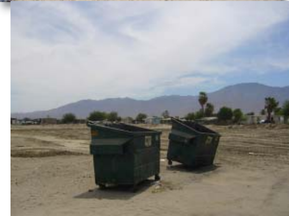
Trailer park waste management, before and after EPA enforcement.

The Desert Mobile Home Park held a community-wide household hazardous waste collection event on October 20, 2007, where community members could bring lead-acid batteries, washers and dryers, refrigerators, condensers and scrap metal; computer hard drives, keyboards, mattresses, microwaves, TVs, computer monitors, and used oil. These materials were then taken to the appropriate recycling and disposal facilities.