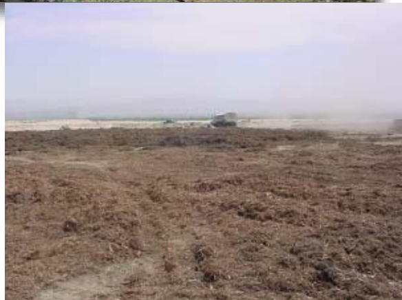
Fillmore Street dump site before EPA and CIWMB cleanups, and after cleanup with mulch from Torlaw site.