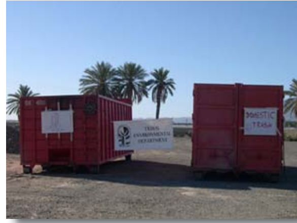
Trashbusters community wide cleanup event.

Members of the taskforce include the Torres Martinez Tribe, Center for Community Action and Environmental Justice, Coachella Valley Association of Governments, California Department of Toxic Substances Control, Riverside County Code Enforcement & Community Improvement Department, Riverside County Fire Department, and EPA.