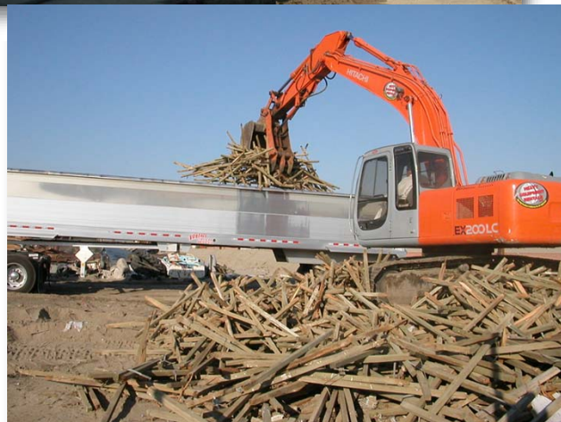
Auclair dump site during cleanup.