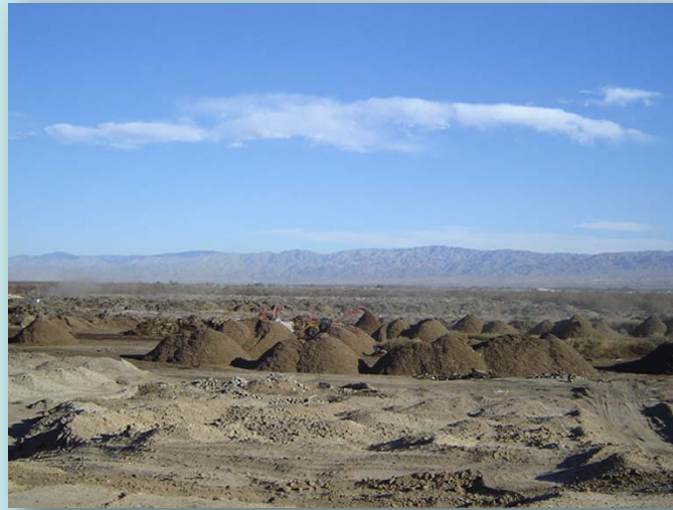
Ibanez dump site cleanup.