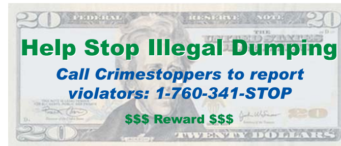
Handout distributed by the Outreach Taskforce at the 2007 Riverside County Fair and Date Festival.

The Coachella Valley was hit hard by the cold spell this past winter. To stay warm some residents burned grape stakes treated with chromated copper arsenate (CCA), which look similar to firewood. However, when burned or cut, CCA-treated wood becomes extremely hazardous and can cause nausea, sore throat, dizziness and headaches. Further, arsenic is also a known carcinogen. Members of the collaborative including the South Coast Air Quality Management District, Department of Toxic Substance Control, Agency for Toxic Substances and Disease Registry, the Torres Martinez Tribe and EPA mobilized quickly to produce Spanish and English public service announcements and fact sheets, and met with growers to inform them of best practices for managing CCA-treated grape stakes.