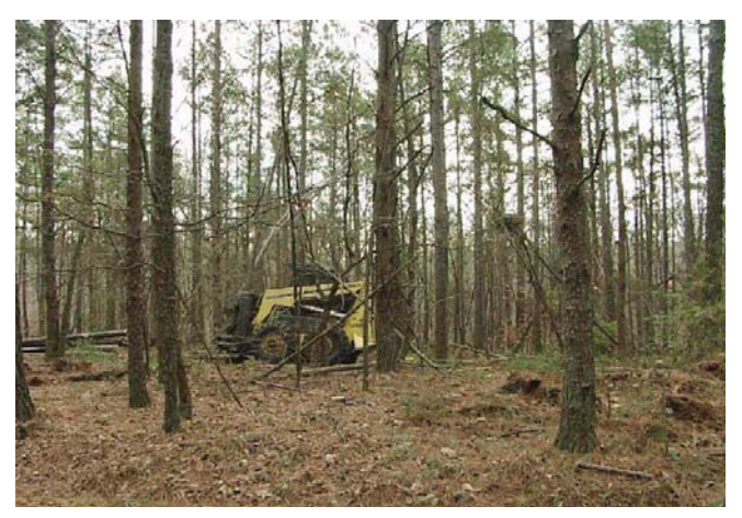
Mechanical thinning with a Bobcat.