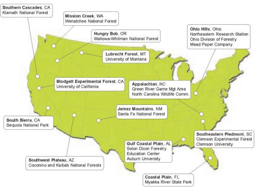
The study sites.

Researchers from a range of disciplines assess seven sets of variables at each site: wildlife, tree pathology, vegetation, fire and fuels, entomology (bark beetles, for example), treatment costs and utilization (economics), and soils and forest floor. By rigorously applying the same experimental design to these varied ecosystems, a picture of the risks and benefits of the treatment regimens is emerging. "We are now analyzing data from the first six years of the FFS studies," says Boerner. The long-range ambition is to continue assessing the experimental treatments over a