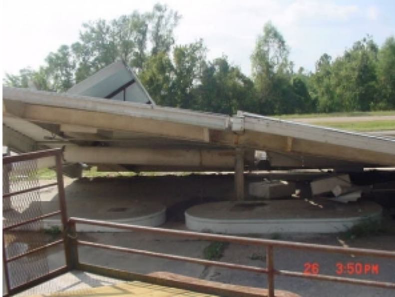
Awning blown down at a gas station in Redwood.

This weak tornado touched down briefly in Redwood and crossed US Highway 61. A man drove his truck through the tornado as it crossed the Highway. The tornado destroyed a metal overhang, knocked over a fence and snapped a few small trees and limb.