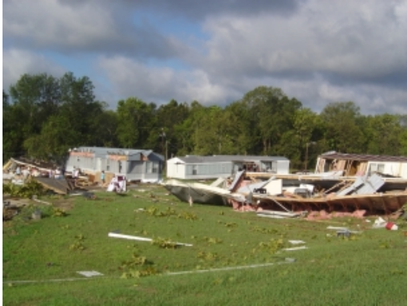
Destroyed mobile homes just northeast of Starkville.

This tornado touched down on the southeast side of Starkville, just southwest of the MSU Campus, in the Sherwood Forest subdivision and tracked northeast for 3.5 miles through the MSU Campus then dissipated at Highway 82.