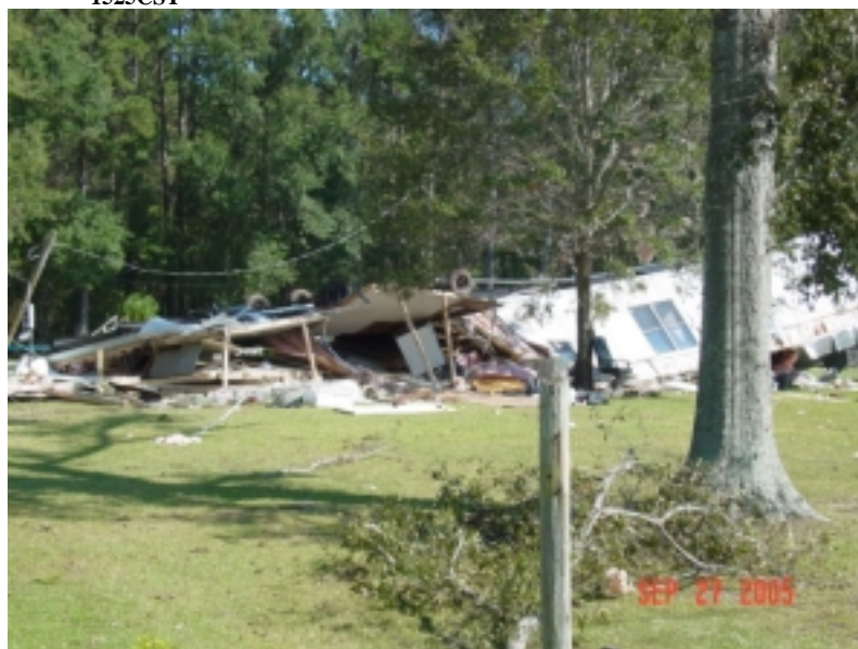
Mobile home flipped over just north of Marion, off Hamm Rd.

25 1521CST 1525CST 1.8 150 0 0 250K 80K Tornado (F1)