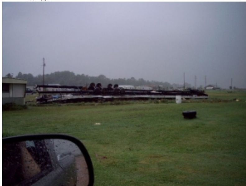
Mobile home destroyed and power lines taken down, just outside Cleveland, MS in Bolivar county.

This tornado touched down between Cleveland and Ruleville about 3 miles southeast of Dockery in Western Sunflower county. The tornado then tracked northwest into Bolivar county just east of Cleveland and then toward Merigold where it dissipated. As the tornado approached Cleveland it remained over open farm land and caused damage to trees and power lines. The tornado became more intense just east and northeast of Cleveland. Here the most significant damage occurred which was within a swath of nearly 2