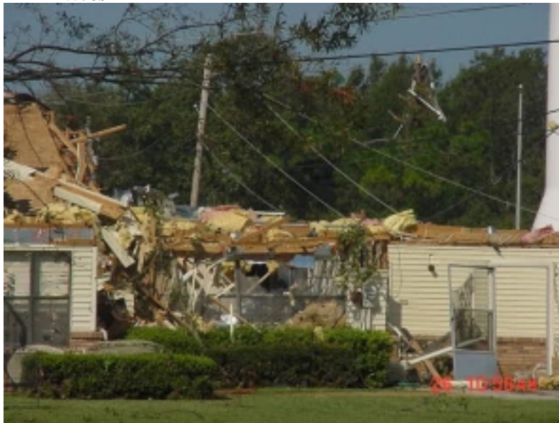
Significant damage to a home in Belzoni, Humphreys county.

24 1554CST 1558CST 5 300 0 0 500K 200K Tornado (F1)