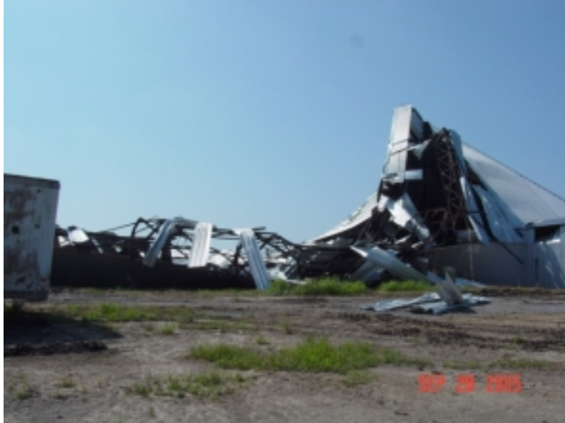
Significant damage to Quito's cotton gin, in Leflore county.

24 1702CST 1712CST 8 250 0 0 1.5M 700K Tornado (F2)