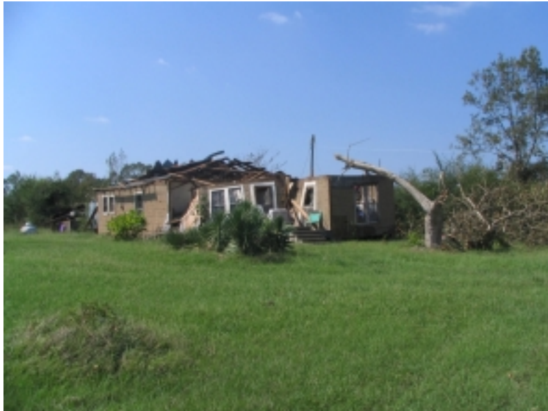
Home with the roof blown off and a few walls blown down, occurred in Jefferson county.

This strong tornado touched down in the Red Lick Community, of Jefferson county, and tracked northeast into Claiborne county. Extensive tree damage occurred along the path with hundreds of trees uprooted and snapped. One mobile home was destroyed and a framed house had most of the roof torn off and an outside wall blown out. One injury occurred as the mobile home was rolled over and destroyed.