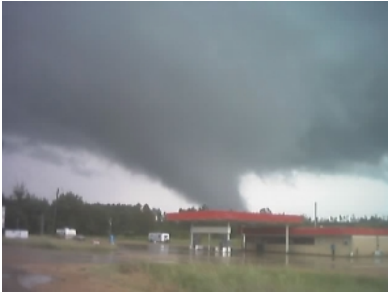
F1 Tornado as it moved near the Leake County Airport.

This tornado touched down just on the southwest side of the Carthage county airport. Three small aircraft were destroyed as one was flipped over and another thrown nearly 1/4 mile into a wooded area. The airport hanger sustained minor damage as the door was blown in. Numerous trees were damaged and uprooted. One home on Jordan Road had windows blown out and several trees down on it. Additionally, one mobile home on Goshen Road sustained minor damage.