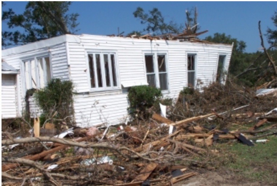
Two story home destroyed and moved off foundation.

9 SW Waterproof to 6 N Waterproof 24 25 2347CST 0004CST 11 100 0 2 1M 100K Tornado (F3)