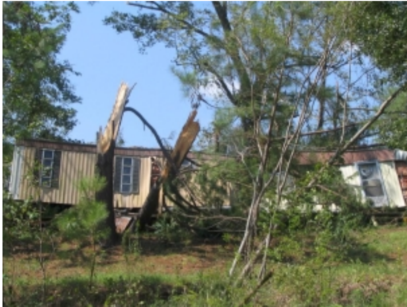
Mobile home rolled over near Fayette.

This strong tornado touched down a few miles west-southwest of Fayette and tracked north-northeast for 10 miles. Extensive tree damage occurred along the path with hundreds of trees snapped and uprooted. A couple of mobile homes were damaged and a house had part of its roof taken off.