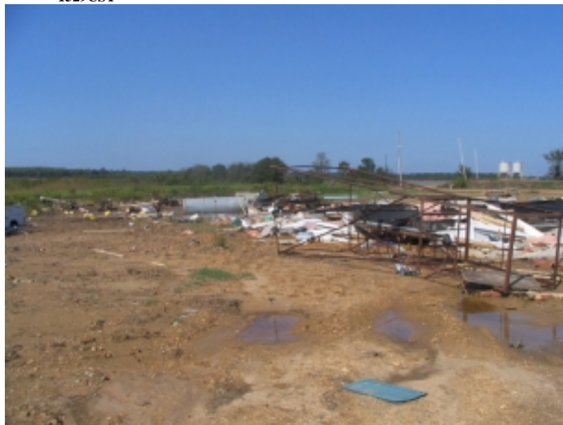
Mobile home destroyed NE of Isola off Sky Lake Road, In far northern Humphreys county.

24 1528CST 1529CST 0.5 100 0 0 Tornado (F1)