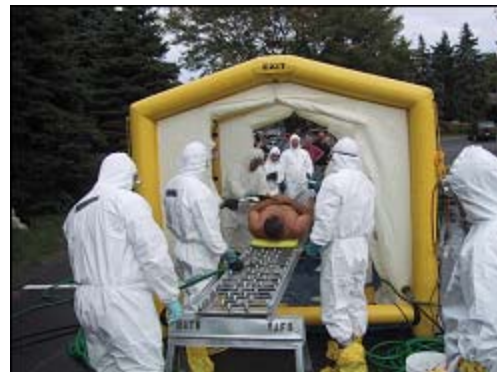
Attendees practice patient decontamination as part of a course held at VA-sponsored conference.

Hospital-Based Patient Decontamination: EMSHG supports the on-going education and training of VA and community health care providers in nuclear, biological, and chemical response and patient decontamination.