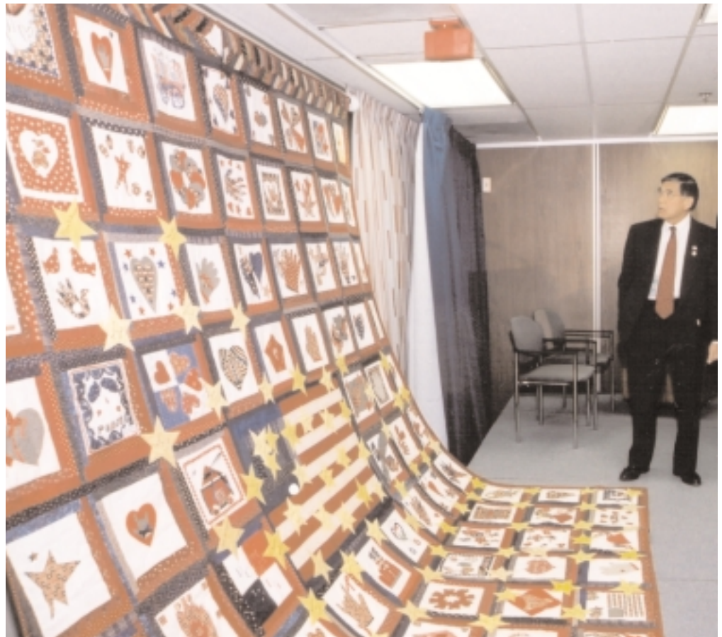
Secretary Mineta admires a quilt presented by DOT to the Department of Defense bearing the name of every woman who died at the Pentagon and on Flight 77 on September 11th.