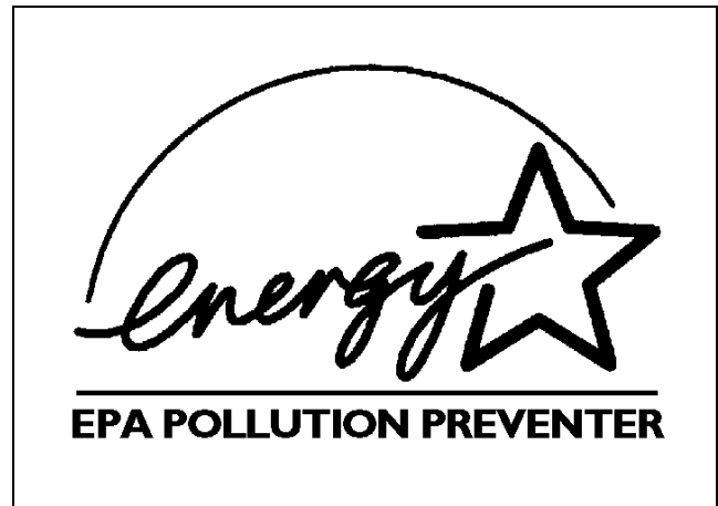
Figure 1. EPA Energy Star sm Logo.

$2 billion, and reduce CO 2 pollution equal to the emissions from 5 million automobiles.