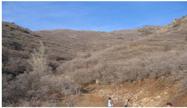
Uintah Highland Fuels