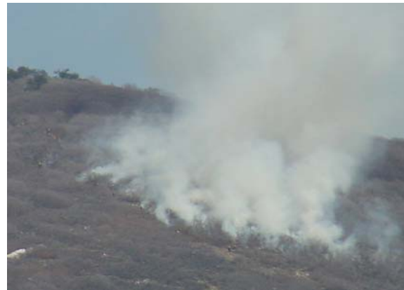
Davis County Prescribed Fire April 2005,

Prescribed fire and wildland fire use are tools that provide for ecosystem maintenance and restoration consistent with land uses and historic fire regimes. Fuels are managed to reduce the risk of damage to private property and to provide for public and firefighter safety by lowering the risk of catastrophic wildfires.