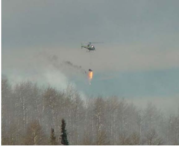
Aerial Ignition, Monte Cristo Unit A, October 2004

OGDEN RANGER DISTRICT Spring 2007/2008 Wasatch-Cache National Forest