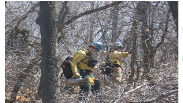
Davis County Prescribed Fire Hand Ignition

The Mountain Green project area consists of approximately 1000 acres in Weber Canyon. The proximity to the railroad, private land, and interstate 84 may increase the potential for a human caused fire in the area. This area is adjacent to private and state lands which may increase the complexity of implementing a prescribed burn. Mechanical treatments may be needed along the forest boundaries to keep the burn on Forest lands. This project is to be implemented in the spring of 2007 and/or 2008.