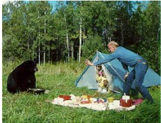
Black bears may enter camps, especially when wild foods are scarce, but they rarely attack people. This bear is about to be sprayed with capsaicin repellent and run away.