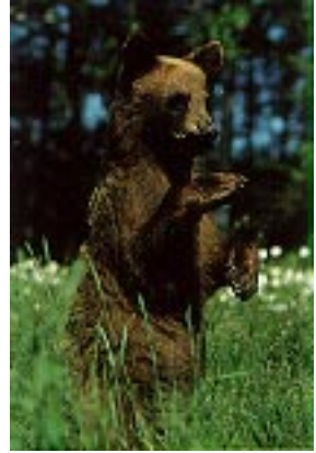
Some black bears are brown. There are no grizzly bears in eastern North America or south of the Yellowstone Ecosystem.

Full-blown attacks by black bears are rare. Black bear attacks are usually not at campgrounds and are usually not by black bears