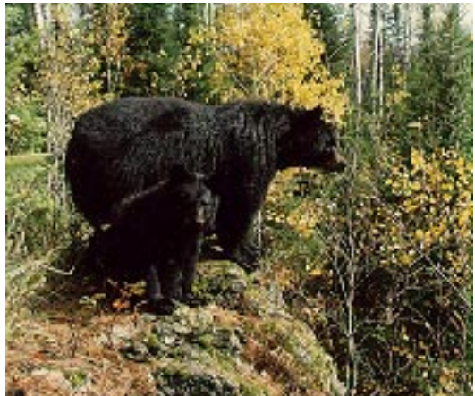
Cubs are born in winter dens and remain with their mothers for about 17 months.

Cubs are born in January after a gestation period of approximately 7 months. Although mating occurs in June, fetal development takes place mainly in the last 2 months of pregnancy after the fertilized egg implants in the uterus in November. Fetuses develop only if the mother has stored enough body fat and other nutrients to survive overwinter and provide milk for her cubs until she resumes feeding in spring. At birth, the cubs weigh less than a pound, have only a light covering of fur, and can barely crawl. The mother eats the birth membranes, licks the cubs, and warms them