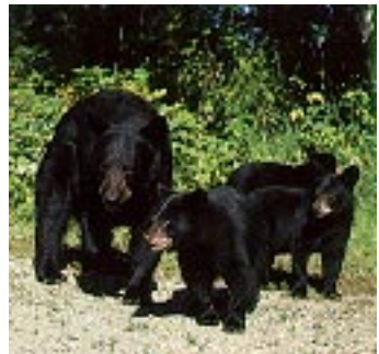
Researchers across America are studying black bears to learn their habitat requirements.

Hearing: Exceeds human frequency range and sensitivity.