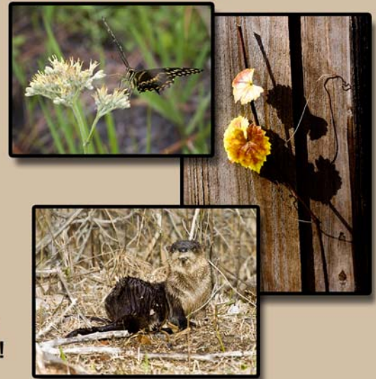
All images © 2008 John P. Reed, all rights reserved

As an intermediate class, the more familiar you are with your camera controls, the more you will gain from the class. BUT!! ALL skill levels are welcome and will benefit. Attendance at the January workshop is not a prerequisite.