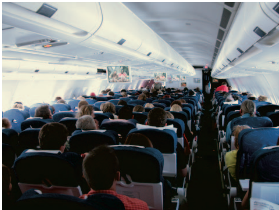
Figure 1: Passenger Cabin of Commercial Airliner