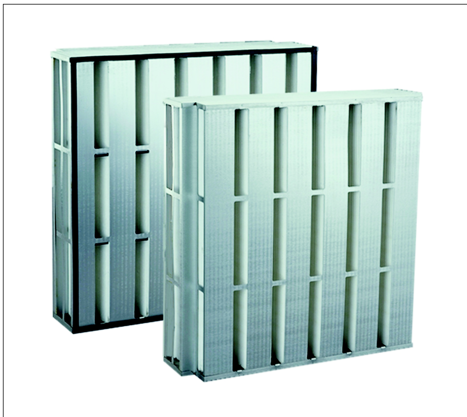
Figure 3: A Typical HEPA Filter for Commercial Passenger Aircraft

Source: © Donaldson Company, Inc. Reproduced with permission.