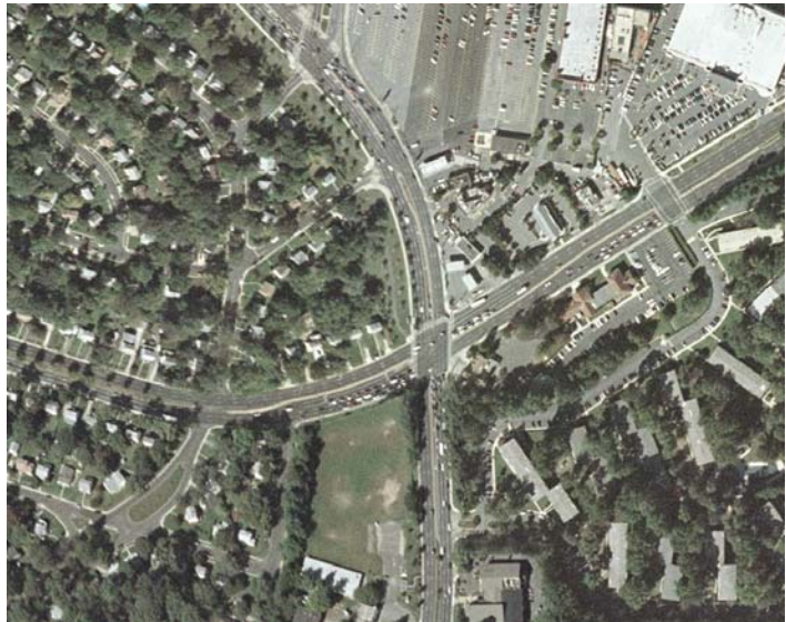
Aerial view of the subject project site.