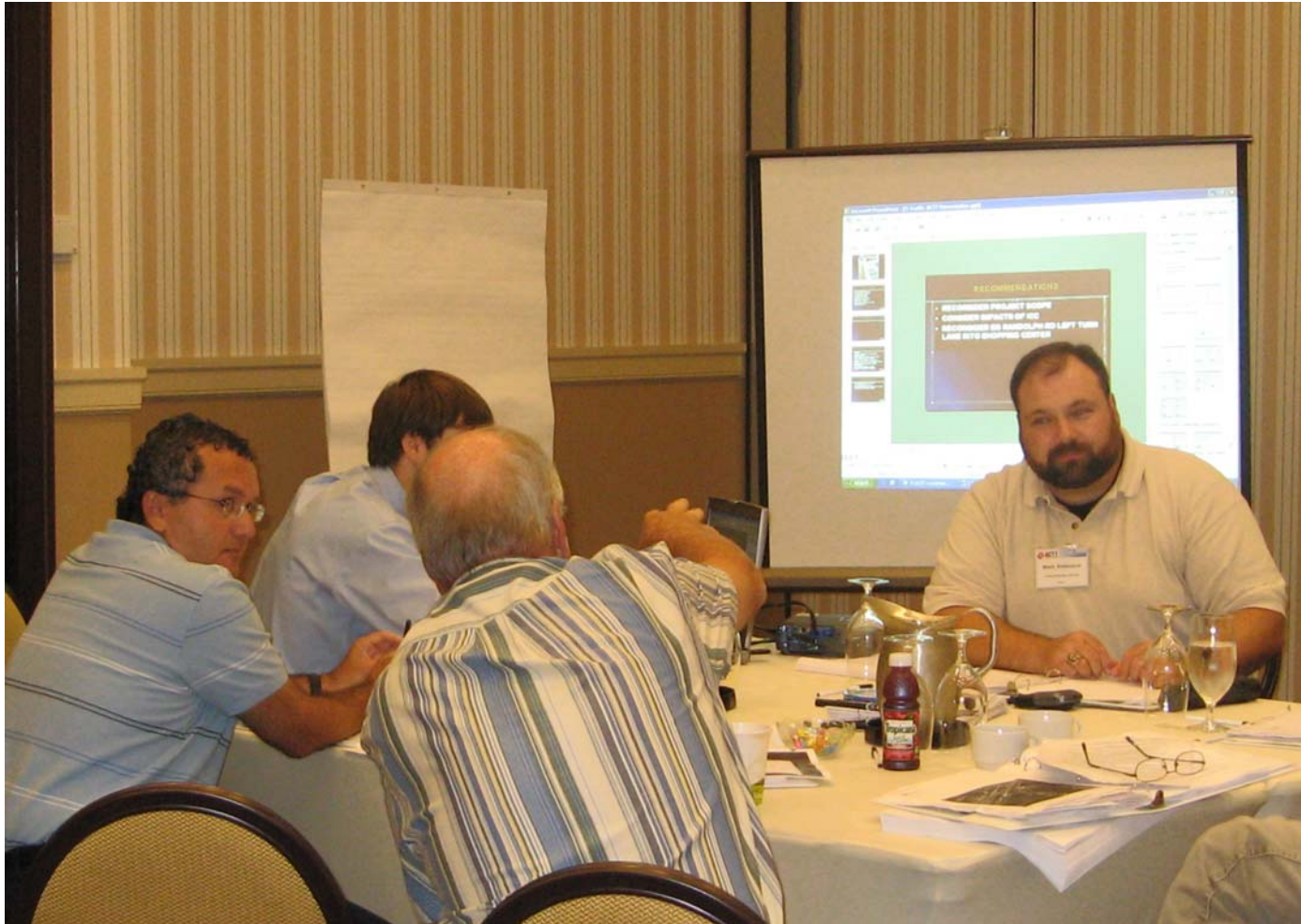
Photo 4: The Traffic Engineering/ITS/Safety skill set members develop their recommendations in a breakout session