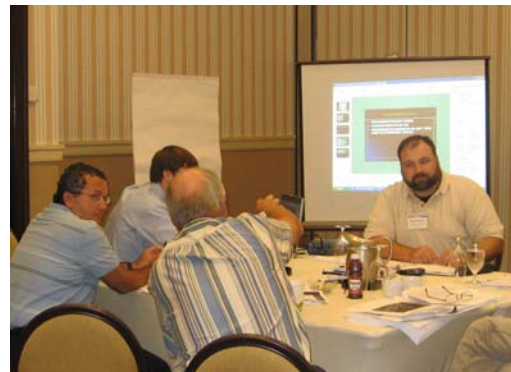
A typical breakout session.