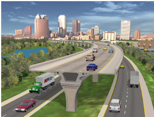
Figure 1: Proposed elevated structure for Randolph Road

The structures team offered the following recommendations: