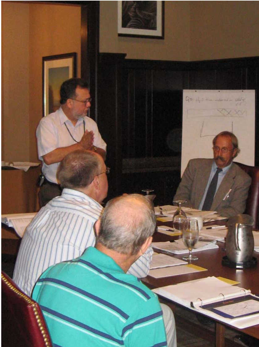
Photo 5: ACTT facilitator (standing) leads the discussion during the Construction skill set team breakout session