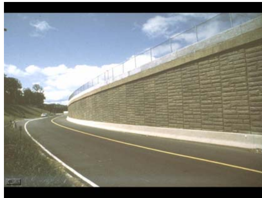
Figure 2: Typical retaining walls that may be used in trenching Randolph Road)