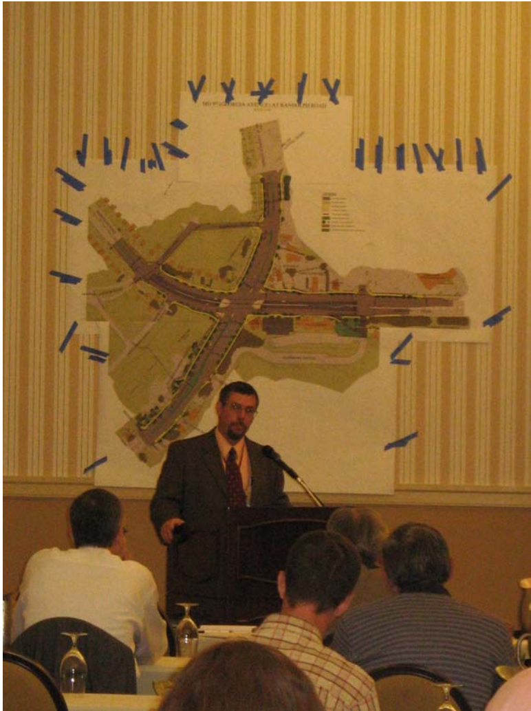
Photo 8: Director, Office of Highway Development, Maryland State Highway Administration, delivers feedback to workshop participants following skill set presentations.