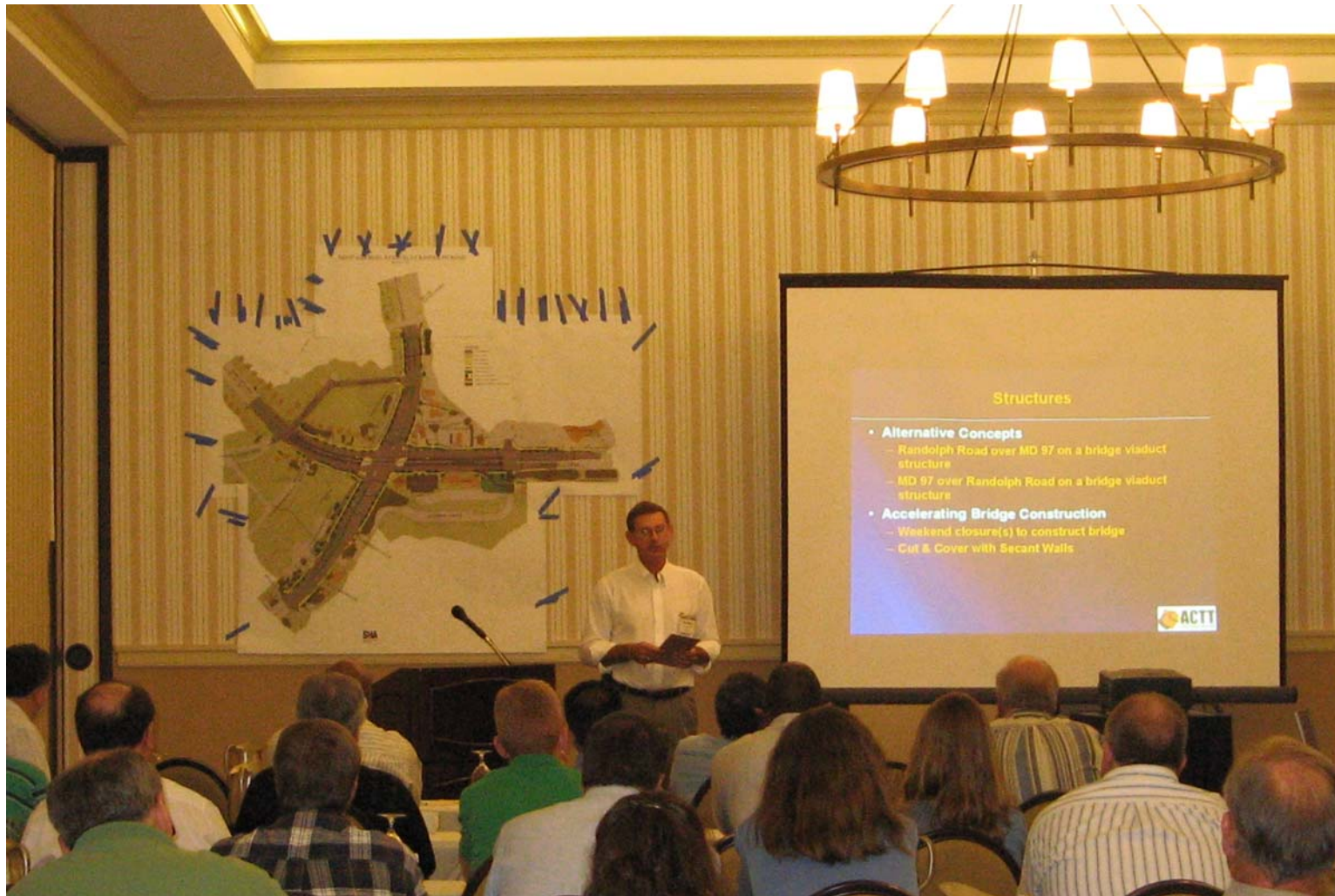
Photo 6: Team member presents the Structures skill set recommendations to other skill sets at the ACTT Workshop.