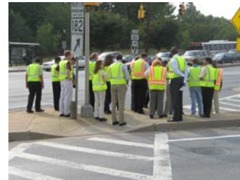
Photos: Touring MD-97 at Randolph Road.