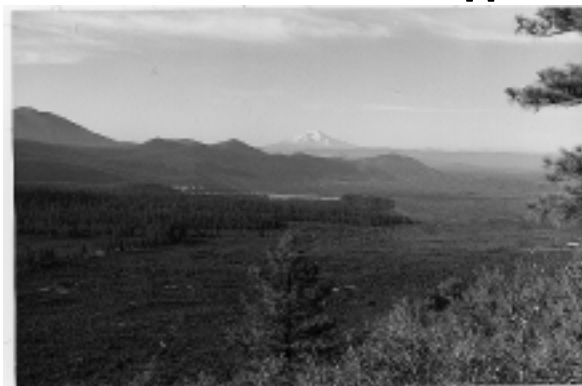
View north to Mt. Shasta from Hat Creek Rim

The PCT continues north on the Hat Creek Ranger District after leaving the National Park. Approximately one mile from the boundary the trail leaves its old location along the base of Badger Mountain and follows a new course, constructed in 1991, through the West Badger Plantations and over to Hat Creek. It continues along upper Hat Creek, past Twin Bridges, to Potato Butte road. At that point the trail is within one tenth of a mile from the town of Old Station. It is an easy walk to Old Station Post Office, general store, pizza parlor and resort.