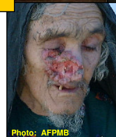
Mucocutaneous leishmaniasis