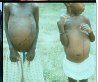
Visceral leishmaniasis