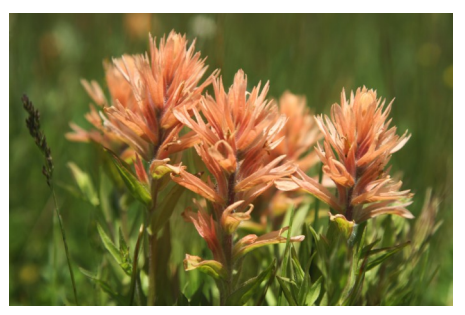
Indian Paintbrush