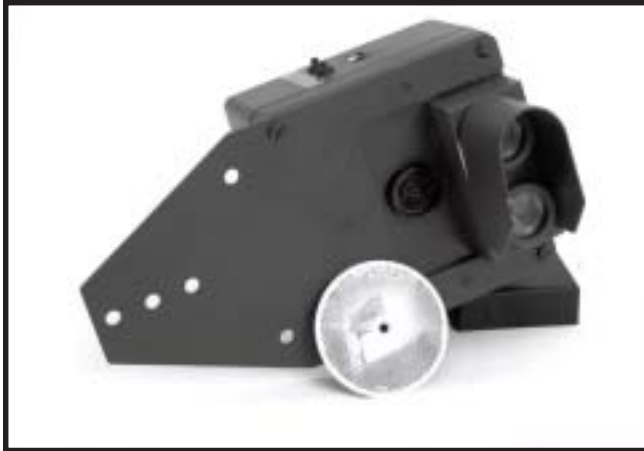
Figure 1—RS 501 portable traffic counter.

TS 601 Traffic Sentry Portable Traffic Counter —The TS 601 counter is basically the same as the RS 501 except that a microprocessor-based data logger is added to store counts within preset time intervals. Three versions offer different date-time programs for surveillance or counting requirements.