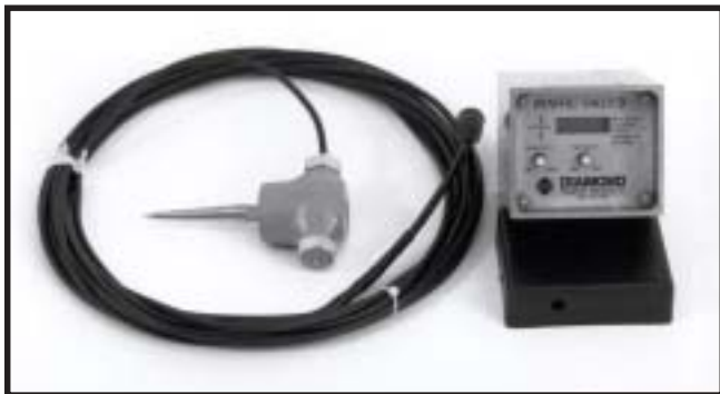
Figure 10—Diamond Traffic Products' TT-3 traffic counter.

TT-3 Counter and TT-3-SS Spike Sensor—The TT-3 counter (figure 10) is also used with the passive infrared sensor. The TT-3 counter is described above in the passive infrared section.