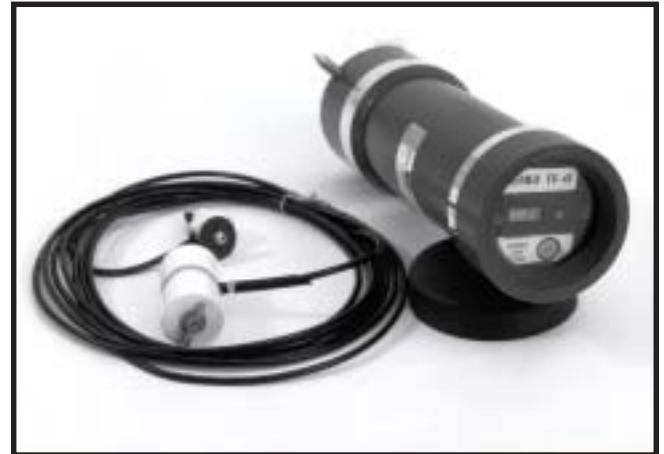
Figure 8—Compu-Tech's TR-41 trail traffic counter (mat not shown).

TR-41 Trail Counter—The Compu-Tech TR-41 trail counter (figure 8) is also used with the passive infrared sensor and is described earlier in the passive infrared section.