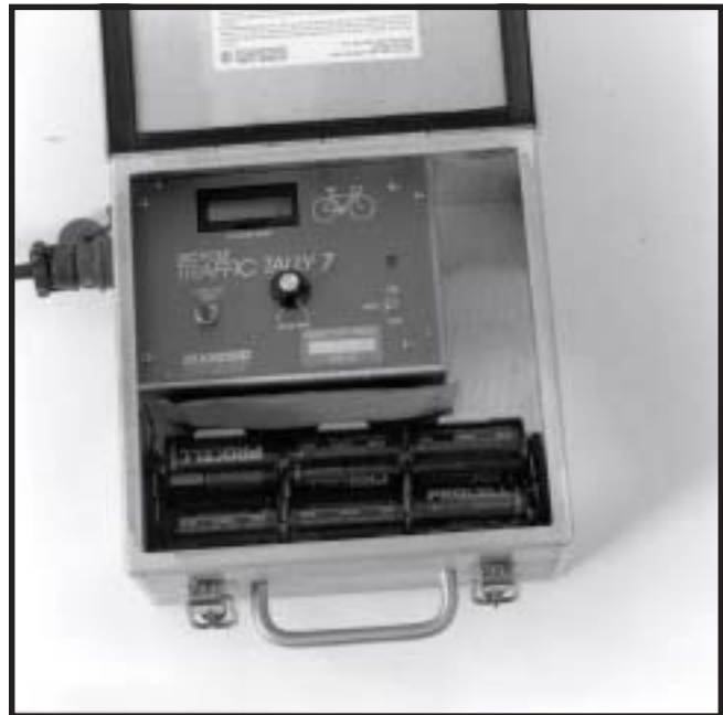
Figure 11—Traffic Tally-7 bicycle counter.

Traffic Tally-7 (TT-7) Bicycle Inductive Loop Counter—The TT-7 bicycle counter (figure 11) is sensitive enough to detect aluminum bicycle wheels passing over loops buried under bike paths. The unit operates on six D cells for over