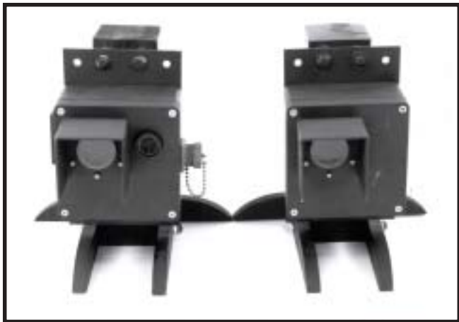
Figure 3—Ivan Technologies trail traffic counter.

to register a count. The units and their batteries are enclosed in weatherproof aluminum housings that can be separated by up to 300 feet (91 meters). Each unit uses four D alkaline batteries that will power the unit for 180 days at 70° F. For cold-weather operation, two D lithium batteries are recommended for each unit. Lithium batteries will power the unit for 270 days. Two N cells power the counter unit for 4 years (alkaline batteries) or 10 years (lithium batteries). Counts are displayed on a six-digit LCD. An optional time-date recorder can store the time and date of each count. The data can be downloaded directly to a personal computer or can be collected with a pocket-sized data collector.