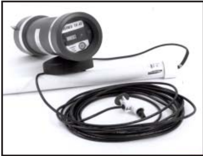
Figure 9—The PR-40 sensor has a geophone attached to a plastic PVC pipe rather than a mat.

TR-41 Trail Counter and SP-20 Spike Sensor—The SP-20 spike sensor is a geophone sensor with a spike on the end to allow it to be pushed into the ground. It is intended for temporary monitoring and is not intended to replace the PR-40 sensor for long-term use.