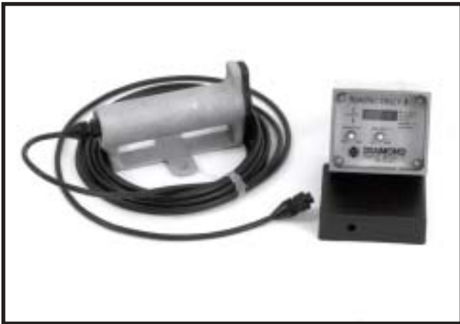
Figure 6—Traffic Tally 3 (TT-3) counter.

Traffic Tally 3 (TT-3) Counter and TT-3-IR Sensor—The TT-3 counter (figure 6) can accommodate either a passive infrared or seismic geophone sensor. The counter unit is contained in a waterproof extruded aluminum case and displays the count on a six-digit LCD. The unit is powered by three C alkaline or two 3.5-volt lithium batteries. The count time delay can be adjusted in the field from 1/2 to 10 seconds. The sensitivity is adjustable from 0 to 100 percent. An optional output for accessories is available for triggering external devices.