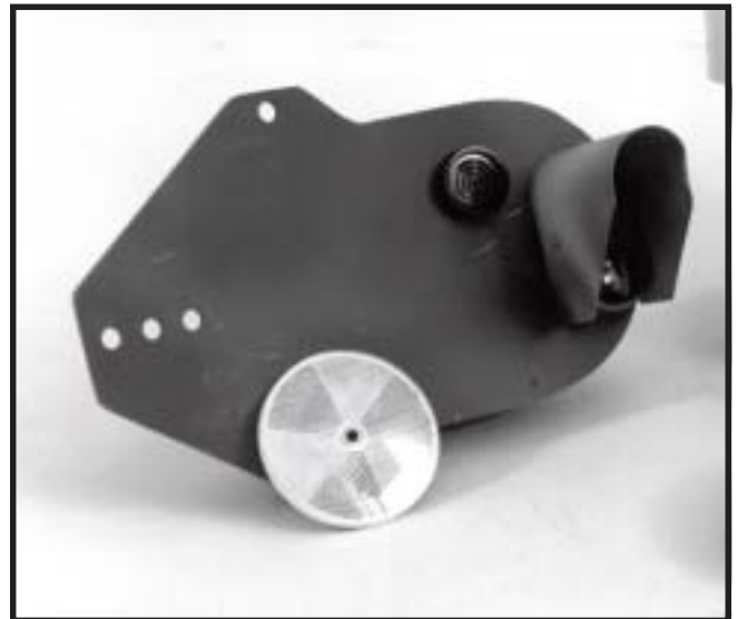
Figure 2—TTC-442 trail traffic counter.

TTC-442 Trail Traffic Counter —The TTC-442 (figure 2) is a redesign of Diamond's old retroreflective TCS-90/TCS-120 trail traffic counter. The new design retains the original cast-aluminum housing, but has all new low-power electronics and will operate 12 to 15 months on four D-size alkaline batteries contained in a lockable compartment. The old external battery box has been eliminated. The housing is finished in dull camouflage. Count is recorded in selectable intervals of minutes; 1, 6, or 12 hours; and 1, 2, 3, 4, 5, 6, 14, or 30 days, for a total of 512 possible intervals. The count is displayed on a six-digit LCD (liquid crystal display). The scanner and reflector can be separated by up to 110 feet (33.5 m). The old TCS-90/TCS-120 counters can be upgraded with the new electronics for less than half the cost of a new unit.