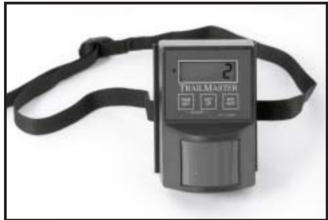
Figure 7—TM300 Trophy Timer.

Models are available that store 1,000-, 4,000-, or 8,000-count events. A built-in LCD provides simple data retrieval. Battery life is over a year for four C alkaline batteries.