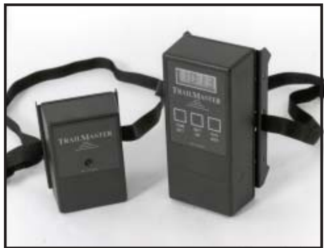
Figure 4—TrailMaster TM1000 trail monitor system.

The TM35-1 35-mm Camera Kit is weatherproof and features a data back, auto-focus, auto-wind, and auto-flash. It is furnished with a tree mount, camera shield, and 25-foot (7.7-meter) cable.