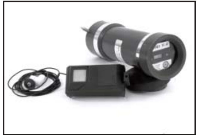
Figure 5—TR-41 trail traffic counter by Compu-Tech Systems.

The DL-125 and DL-150 data loggers record time and date for up to 250 events in the Event mode. Alternatively, the data loggers can record counts per time interval in eight selectable intervals from 15 minutes to 24 hours. Data can