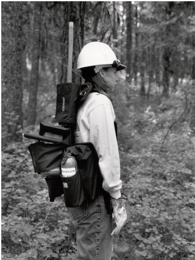
Figure 1b—MacKenzie “Mack” chain saw pack by Frontline Safety Gear (side view).

pockets designed to hold a fire shelter and a tool kit. Two additional side pockets will hold 32-ounce Nalgene water bottles or Sigg-type fuel bottles. Additional D-rings and webbing allow other tools or equipment to be secured to the pack. The pack (available in red or green) has a padded back and hip belt. Custom colors may be available by special request through the manufacturer.