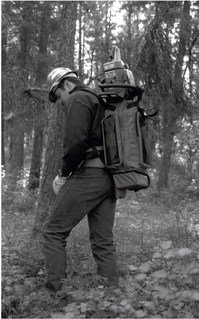
Figure 2b—Epperson Mountaineering chain saw pack (side view).