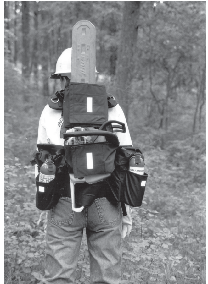
Figure 1a—MacKenzie “Mack” chain saw pack by Frontline Safety Gear (back view).

The MacKenzie “Mack” chain saw backpack (figures 1a and b), manufactured by Frontline Safety Gear of Cook, MN, is designed to carry the engine low with the bar pointing up. The weight of the saw rides on the individual’s hips. The pack is made of Cordura nylon fabric and is designed to carry both full- and half-wrap handlebars. The Mack pack has two large