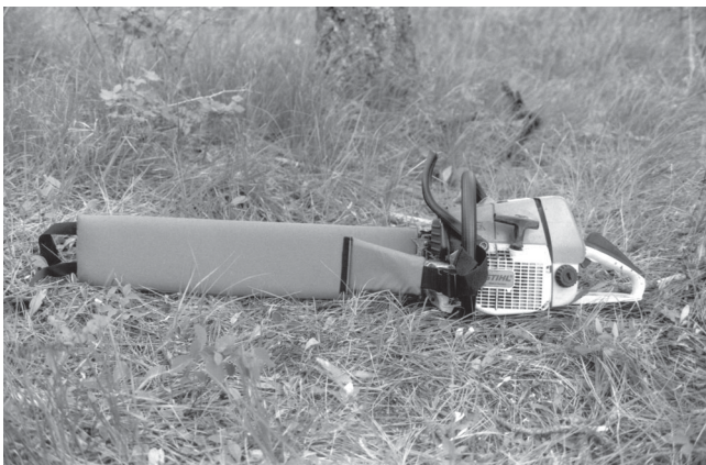
Figure 3—Chain saw bar in removable sleeve of the Epperson Mountaineering chain saw backpack.

The cost of the Epperson chain saw backpack was $130 in June 2001. For further information, contact the manufacturer at: