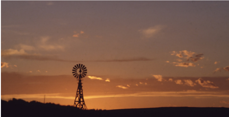
Sunrise on the Prairie