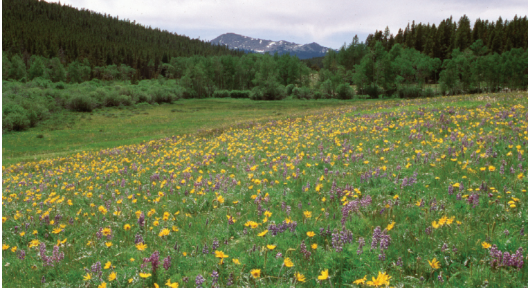
Hillside on the Bighorn National Forest