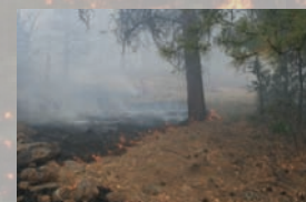
Bargaman Fire was the 1st Wildland Fire Use on the Coconino.