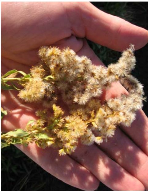
Canada goldenrod producing seed

Year Awarded: 2005 Project completion: 2008 Report number: 4 of 4 Expenditures: • FY05 funding $30,000; expend. $7,872; obligated $19,300