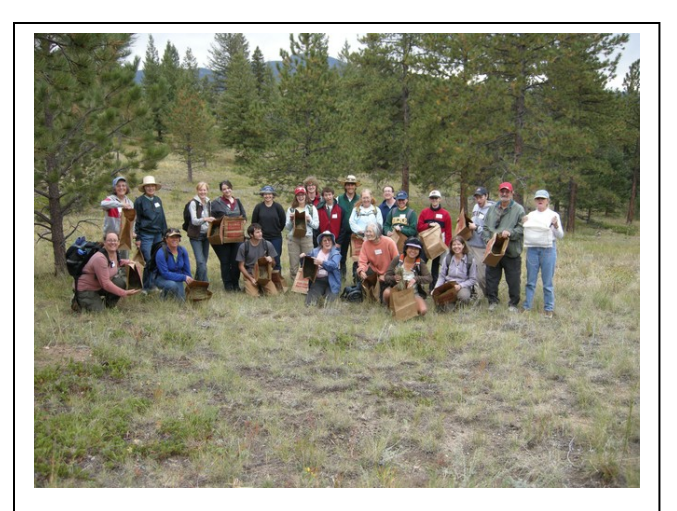
Wildland Restoration Volunteers collection seed