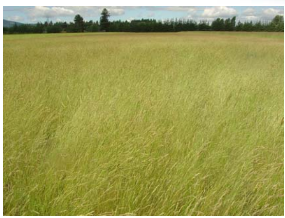
Figure 2. Fescue field at CDA Nursery