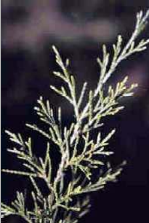
Photo courtesy of: Smithsonian Institution, Dept. of Systematic Biology, Botany . This image is not copyrighted and may be freely used for any purpose. Please credit the artist, original publication if applicable, and the USDA-NRCS PLANTS Database. The following format is suggested and will be appreciated: @ USDA-NRCS PLANTS Database.

Other common names; cedar, cedar tree, red cedar, Virginia redcedar, pencil cedar, juniper, red juniper, evergreen, savin.