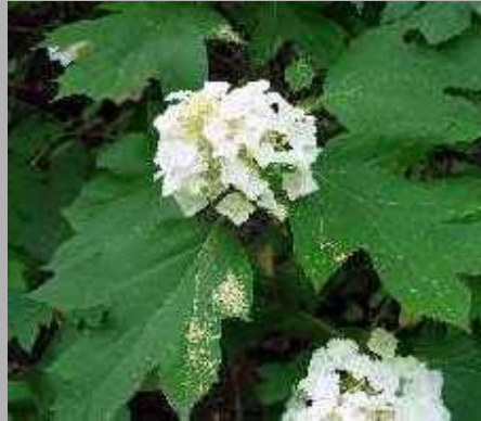
Photo courtesy of: J.S. Peterson. USDA NRCS NPDC . USDA ARS National Arboretum, Washington, DC. June 27, 2003. This image is not copyrighted and may be freely used for any purpose. Please credit the artist, original publication if applicable, and the USDA-NRCS PLANTS Database. The following format is suggested and will be appreciated: J.S. Peterson @ USDA- NRCS PLANTS Database.

Other common names; mountain hydrangea, French hydrangea, peegee hydrangea, hydrangea, graybeard.