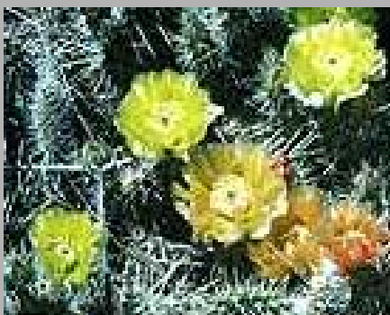
Photo courtesy of: ©W.L. Wagner. Courtesy of Smithsonian Institution, Dept. of Systematic Biology, Botany . This copyrighted image may be freely used for any non-commercial purpose. For commercial use please contact George F. Russell . Please credit the artist, original publication if applicable, and the USDA-NRCS PLANTS Database. The following format is suggested and will be appreciated: W.L. Wagner @ USDA-NRCS PLANTS Database.

Other common names; plains prickly-pear, brittle cactus, hairspine cactus and Indian fig.