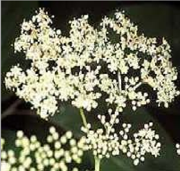
Photo courtesy of: Robert H. Mohlenbrock. USDA SCS. 1989. Midwest wetland flora: Field office illustrated guide to plant species . Midwest National Technical Center, Lincoln, NE. Courtesy of USDA NRCS Wetland Science Institute . This image is not copyrighted and may be freely used for any purpose. Please credit the artist, original publication if applicable, and the USDA-NRCS PLANTS Database. The following format is suggested and will be appreciated: Robert H. Mohlenbrock @ USDA-NRCS PLANTS Database / USDA SCS. 1989. Midwest wetland flora: Field office illustrated guide to plant species. Midwest National Technical Center, Lincoln, NE.