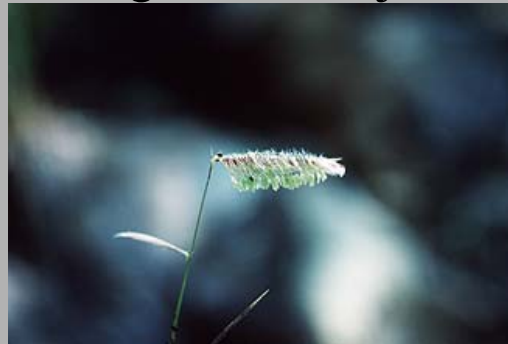
Photo courtesy of: ©W.L. Wagner. Courtesy of Smithsonian Institution, Dept. of Systematic Biology, Botany . This copyrighted image may be freely used for any non-commercial purpose. For commercial use please contact George F. Russell . Please credit the artist, original publication if applicable, and the USDA-NRCS PLANTS Database. The following format is suggested and will be appreciated: W.L. Wagner @ USDA-NRCS PLANTS Database.

Other common names: graceful grama grass, purple grama, red grama, white grama, narajita azul.