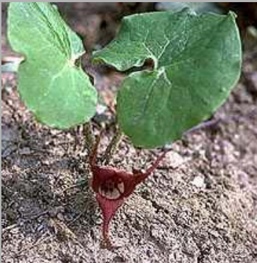
Photo courtesy of: ©William S. Justice. Courtesy of Smithsonian Institution, Dept. of Systematic Biology, Botany . This copyrighted image may be freely used for any non-commercial purpose. For commercial use

Other common names; wild ginger, American wild ginger, Indian ginger, Canadian snakeroot, snakeroot, Vermont snakeroot, heart snakeroot, southern snakeroot, black snakeroot, coltsfoot snakeroot, coltsfoot, false coltsfoot, black snakeweed, broad-leaved asarabacca, asarum, colicroot, beaver potato.