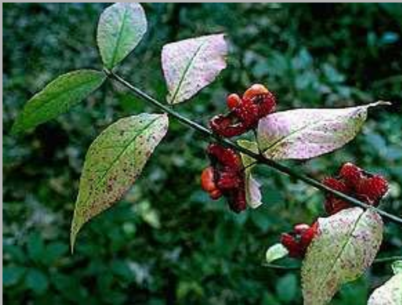
This copyrighted image may be freely used for any non-commercial purpose. For commercial use please contact