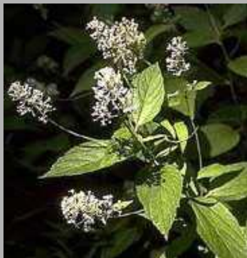
Photo courtesy of: ©Jim Stasz, MD. This copyrighted image may be freely used for any non-commercial purpose. For commercial use please contact Jim Stasz . Please credit the artist, original publication if applicable, and the USDA-NRCS PLANTS Database. The following format is suggested and will be appreciated: Jim Stasz @ USDA-NRCS PLANTS Database.

Other common names; inland ceanothus, Indian tea, walpalo tea, mountain sweet, wild snowbell, red root and spangles.