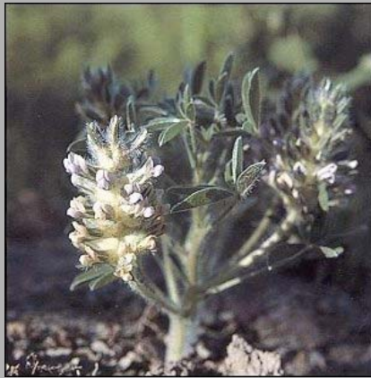
Photo courtesy of: Bonnie Heidel, DOI, USGS. Prairie Wildflowers and Grasses of North Dakota . Northern Prairie Wildlife Research Center.

Other common names; Indian breadroot, breadroot, prairie turnip, prairie potato, prairie apple, wild turnip, pomme blanche, pommede prairie, tipsin, tipsinna.