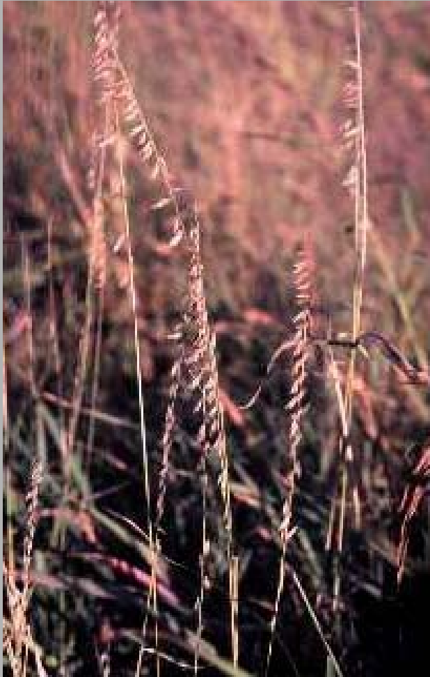
Photo courtesy of: ©Larry Allain. USGS NWRC . This copyrighted image may be freely used for any non-commercial purpose. For commercial use please contact Larry Allain . Please credit the artist, original publication if applicable, and the USDA-NRCS PLANTS Database. The following format is suggested and will be appreciated: Larry Allain @ USDA-NRCS PLANTS Database.