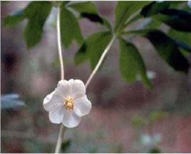
Photo courtesy of: Clarence A. Rechenthin. Courtesy of USDA NRCS Texas State Office . This image is not copyrighted and may be freely used for any purpose. Please credit the artist, original publication if applicable, and the USDA-NRCS PLANTS Database. The following format is suggested and will be appreciated: Clarence A. Rechenthin @ USDA-NRCS PLANTS Database.