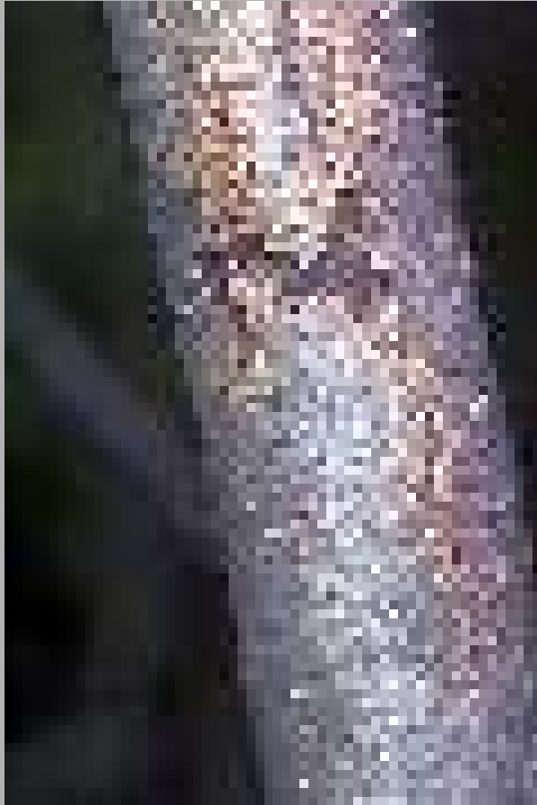
Photo courtesy of: Robert H. Mohlenbrock. USDA NRCS. 1992. Western wetland flora: Field office guide to plant species . West Region, Sacramento, CA. Courtesy of USDA NRCS Wetland Science Institute . This image is not copyrighted and may be freely used for any purpose. Please credit the artist, original publication if applicable, and the USDA-NRCS PLANTS Database. The following format is suggested and will be appreciated: Robert H. Mohlenbrock @ USDA-NRCS PLANTS Database / USDA NRCS. 1992. Western wetland flora: Field office guide to plant species . West Region, Sacramento, CA.