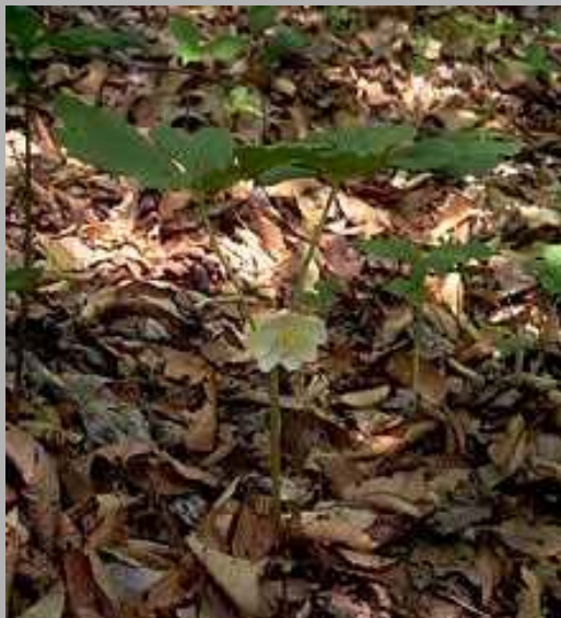
Photo courtesy of: ©Jim Stasz. This copyrighted image may be freely used for any non-commercial purpose. For commercial use please contact Jim Stasz . Please credit the artist, original publication if applicable, and the USDA-NRCS PLANTS Database. The following format is suggested and will be appreciated: Jim Stasz @ USDA-NRCS PLANTS Database.

Other common names: American mandrake, mandrake, wild mandrake, wild lemon, ground lemon, hog apple, devil's apple, Indian apple, raccoon berry, duck's foot, umbrella plant, umbrella leaf, vegetable calomel, American podofili, pomme de mai, podophylle pelte.