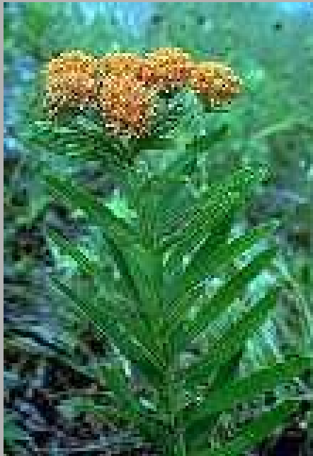
Photo courtesy of: ©William S. Justice. Courtesy of Smithsonian Institution, Dept. of Systematic Biology, Botany . This copyrighted image may be freely used for any non-commercial purpose. For commercial use please contact George E. Russell . Please credit the artist, original publication if applicable, and the USDA-NRCS PLANTS Database. The following format is suggested and will be appreciated: William S. Justice @ USDA-NRCS PLANTS Database.

Other common names; chigger weed, pleurisy root, butterfly weed, Indian post, Canada tuber, Canada flux, orangeroot, orange milkweed, whiteroot, windroot, yellow milkweed.