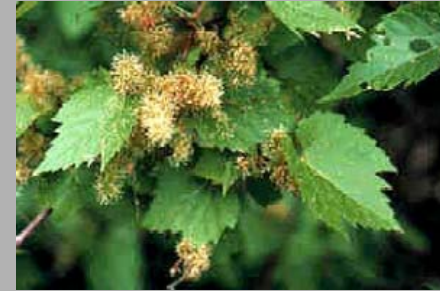
Photo courtesy of: Bill Summers. USDA SCS. 1991. Southern wetland flora: Field office guide to plant species. South National Technical Center, Fort Worth, TX. Courtesy of USDA NRCS Wetland Science Institute .

Other common names; frost grape, winter grape, fox grape.