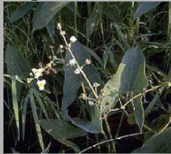
Photo courtesy of: ©Jim Stasz. NJ. This copyrighted image may be freely used for any non-commercial purpose. For commercial use please contact Jim Stasz . Please credit the artist, original publication if applicable, and the USDA-NRCS PLANTS Database. The following format is suggested and will be appreciated: Jim Stasz @ USDA-NRCS PLANTS Database.

Other common names; arrowhead, common arrowhead, Indian potato, tule potato, duck potato, muskrat potato, wapato.