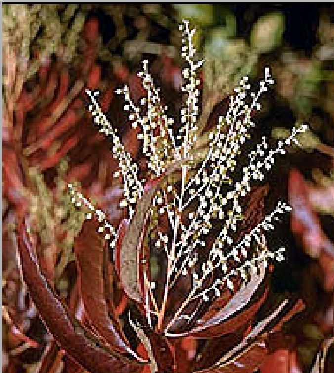
Photo courtesy of: ©William S. Justice. Courtesy of Smithsonian Institution, Dept. of Systematic Biology, Botany . This copyrighted image may be freely used for any non-commercial purpose. For commercial use please contact George F. Russell . Please credit the artist, original publication if applicable, and the USDA-NRCS PLANTS Database. The following format is suggested and will be appreciated: William S. Justice @ USDA-NRCS PLANTS Database.

Other common names; sorrel tree, lily-of-the-valley-tree, sour gum, elk tree.