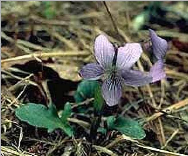
Photo courtesy of: ©Jim Stasz. This copyrighted image may be freely used for any non-commercial purpose. For commercial use please contact Jim Stasz . Please credit the artist, original publication if applicable, and the USDA-NRCS PLANTS Database. The following format is suggested and will be appreciated: Jim Stasz @ USDA-NRCS PLANTS Database.