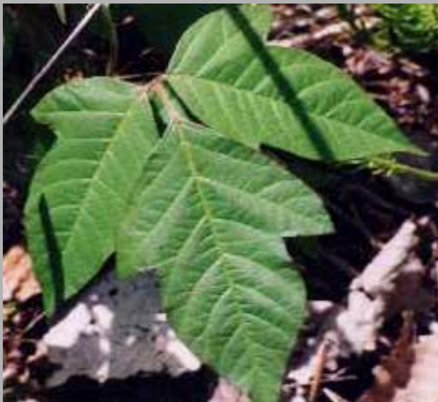
Nahant Marsh, Davenport, Scott Co., IA. 2001. This image is not copyrighted and may be freely used for any purpose.

Other common names; poison ivy, vine poison ivy.