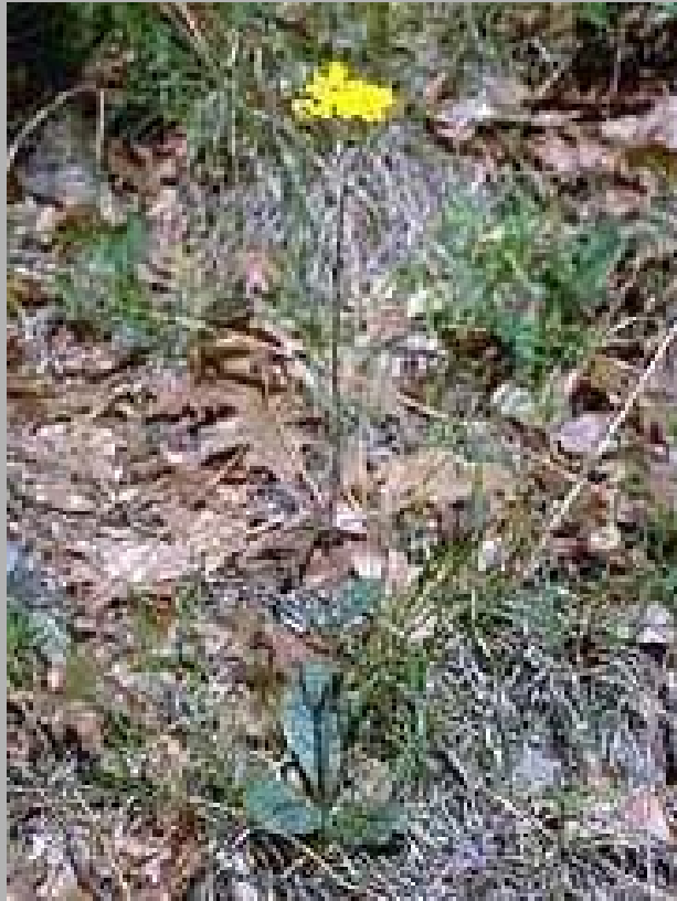
Photo courtesy of: ©Jim Stasz. This copyrighted image may be freely used for any non-commercial purpose. For commercial use please contact Jim Stasz . Please credit the artist, original publication if applicable, and the USDA-NRCS PLANTS Database. The following format is suggested and will be appreciated: Jim Stasz @ USDA-NRCS PLANTS Database .