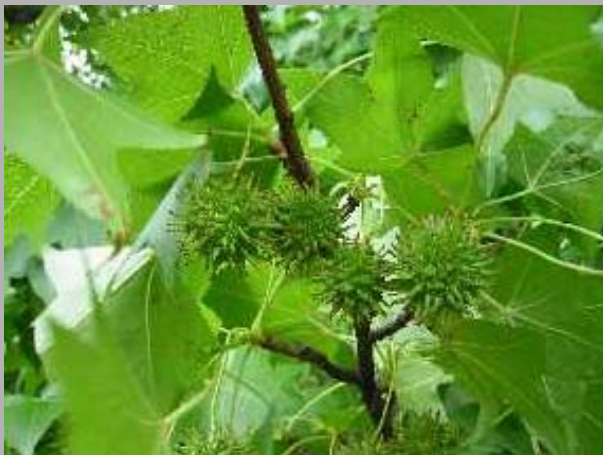
Photo courtesy of: ©J.S. Peterson. USDA NRCS NPDC . USDA ARS National Arboretum, Washington, D.C.. June 13, 2002. This copyrighted image may be freely used for any non-commercial purpose. For commercial use please contact J.S. Peterson .

Other common names: American sweetgum, American storax, storax, American styrax, styrax, gum-wood, star-leaf gum, sap gum, red gum, white gum, amberboom, bilsted, satin-walnut, alligator-tree, opossum-tree, copalm balsam.