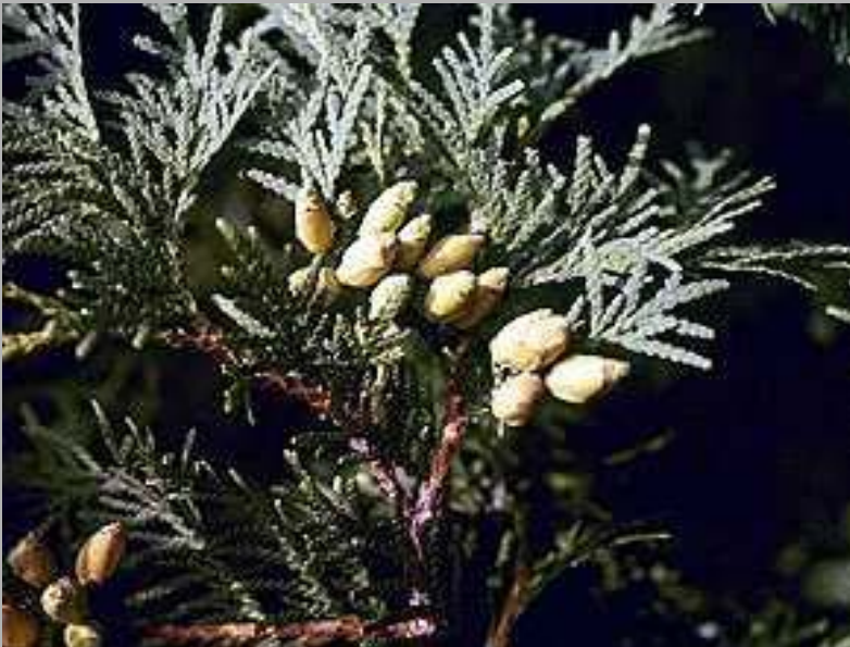
Photo courtesy of: ©R.A. Seelig. Courtesy of Smithsonian Institution, Dept. of Systematic Biology, Botany . This copyrighted image may be freely used for any non-commercial purpose. For commercial use please contact George F. Russell . Please credit the artist, original publication if applicable, and the USDA-NRCS PLANTS Database. The following format is suggested and will be appreciated: R.A. Seelig @ USDA-NRCS PLANTS Database.

Other common names; flat cedar, cedar, white cedar, Eastern white cedar, Atlantic red cedar, yellow cedar, featherleaf cedar, swamp cedar, arborvitae, American arborvitae, Eastern arborvitae.