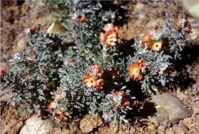
Photo courtesy of: Margaret Williams. Courtesy of Nevada Native Plant Society . ©Nevada Native Plant Society. This copyrighted image may be freely used for any non-commercial purpose. For commercial use please contact Gary A. Monroe . Please credit the artist, original publication if applicable, and the USDA-NRCS PLANTS Database. The following format is suggested and will be appreciated: Margaret Williams @ USDA-NRCS PLANTS Database .

Other common names; red false mallow, false mallow, common globemallow, scarlet globemallow, prairie mallow, desert mallow, flame mallow, copper mallow, cowboy's delight.