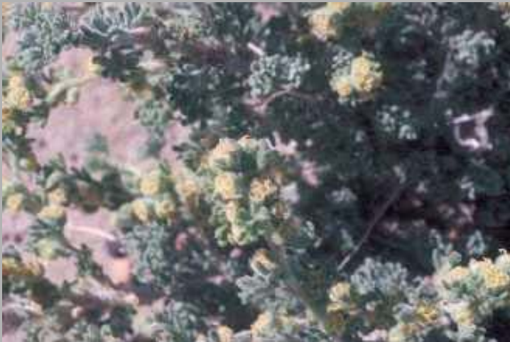
Photo courtesy of: ©Gary A. Monroe. Churchill Co., NV. This copyrighted image may be freely used for any non-commercial purpose. For commercial use please contact Gary A. Monroe . Please credit the artist, original publication if applicable, and the USDA-NRCS PLANTS Database. The following format is suggested and will be appreciated: Gary A. Monroe @ USDA-NRCS PLANTS Database.

Other common names; fringed sagebrush, fringed sagewort, fringed sage, prairie sage, wormwood, pasture sagebrush, and woman sage.