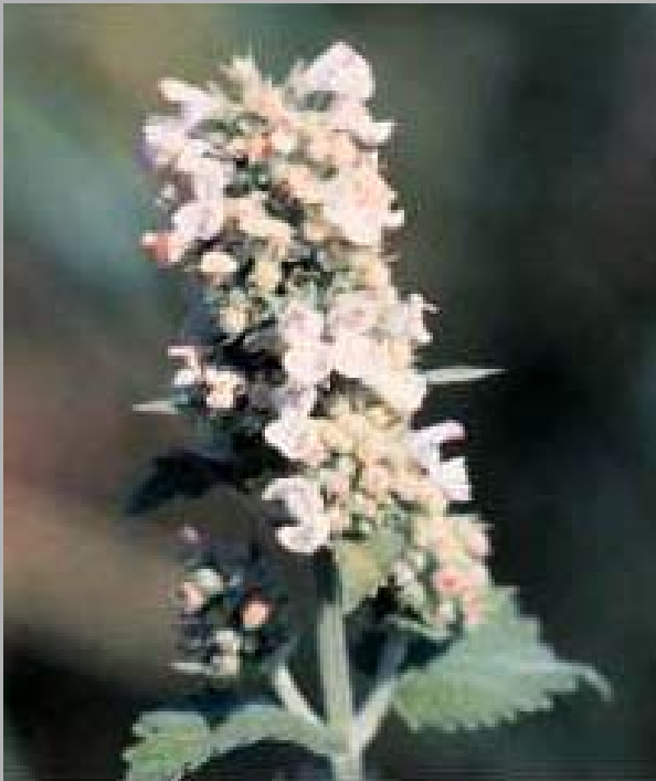
Photo courtesy of: ©Larry Allain. USGS NWRC . This copyrighted image may be freely used for any non-commercial purpose. For commercial use please contact Larry Allain . Please credit the artist, original publication if applicable, and the USDA-NRCS PLANTS Database. The following format is suggested and will be appreciated: Larry Allain @ USDA-NRCS PLANTS Database .