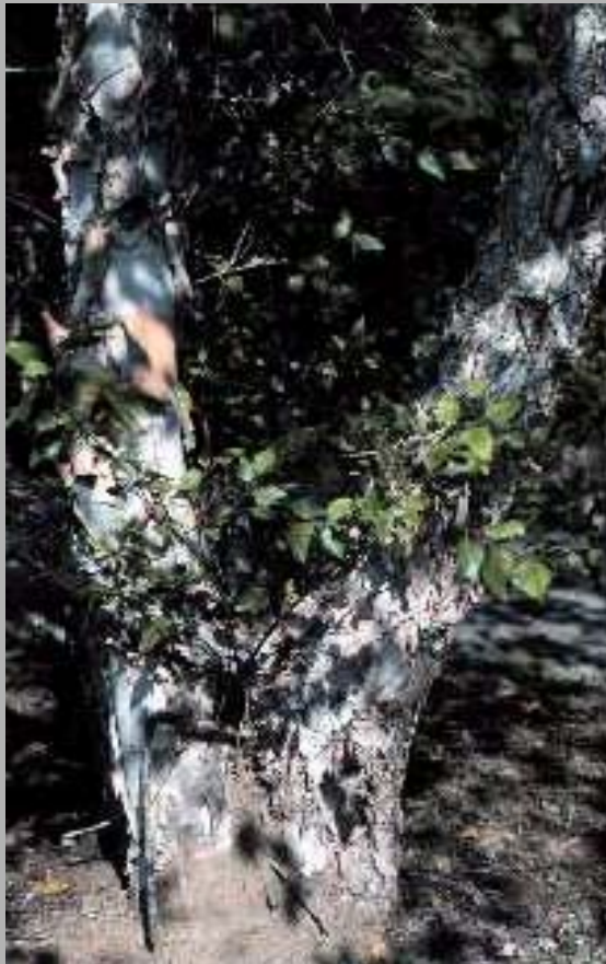
Photo courtesy of: ©Larry Allain. USGS NWRC . This copyrighted image may be freely used for any non-commercial purpose. For commercial use please contact Larry Allain . Please credit the artist, original publication if applicable, and the USDA-NRCS PLANTS Database. The following format is suggested and will be appreciated: Larry Allain @ USDA-NRCS PLANTS Database .

Other common names; black birch, red birch, Japanese red birch, water birch.