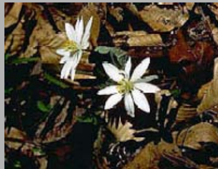
Photo courtesy of: ©Jim Stasz. This copyrighted image may be freely used for any non-commercial purpose. For commercial use please contact Jim Stasz . Please credit the artist, original publication if applicable, and the USDA-NRCS PLANTS Database. The following format is suggested and will be appreciated: Jim Stasz @ USDA-NRCS PLANTS Database.