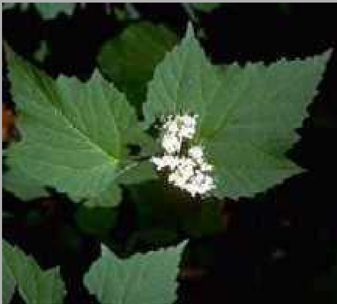
Photo courtesy of: ©Jim Stasz. This copyrighted image may be freely used for any non-commercial purpose. For commercial use please contact Jim Stasz . Please credit the artist, original publication if applicable, and the USDA-NRCS PLANTS Database. The following format is suggested and will be appreciated: Jim Stasz @ USDA-NRCS PLANTS Database.