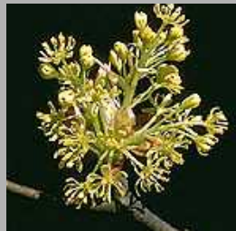
Photo courtesy of: @William S. Justice. Courtesy of Smithsonian Institution, Dept. of Systematic Biology, Botany . This copyrighted image may be freely used for any non-commercial purpose. For commercial use please contact George F. Russell . Please credit the artist, original publication if applicable, and the USDA-NRCS PLANTS Database. The following format is suggested and will be appreciated: William S. Justice @ USDA-NRCS PLANTS Database .

Other common names: common sassafras, white sassafras, saxifrax, sassahura, mitten tree, ague tree, cinnamon wood, gumbo filé, gumbo, saloop, smelling stick, laurier des Iroquois.