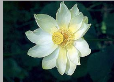
Photo courtesy of: ©Donald R. Kurz. Courtesy of Smithsonian Institution, Dept. of Systematic Biology, Botany . This copyrighted image may be freely used for any non-commercial purpose. For commercial use please contact George F. Russell . Please credit the artist, original publication if applicable, and the USDA-NRCS PLANTS Database. The following format is suggested and will be appreciated: Donald R. Kurz @ USDA-NRCS PLANTS Database .

Other common names; lotus, yellow lotus, water chinquapin.