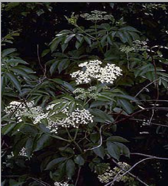
Photo courtesy of: @Jim Stasz. This copyrighted image may be freely used for any non-commercial purpose. For commercial use please contact Jim Stasz . Please credit the artist, original publication if applicable, and the USDA-NRCS PLANTS Database. The following format is suggested and will be appreciated: Jim Stasz @ USDA-NRCS PLANTS Database.