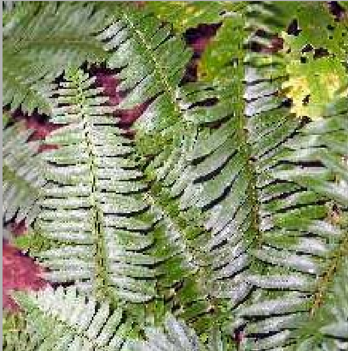
Photo courtesy of: J.S. Peterson. USDA NRCS NPDC . USDA ARS National Arboretum, Washington, DC. June 27, 2003. This image is not copyrighted and may be freely used for any purpose. Please credit the artist, original publication if applicable, and the USDA-NRCS PLANTS Database. The following format is suggested and will be appreciated: J.S. Peterson @ USDA-NRCS PLANTS Database .

Other common name: Polystic faux-acrostic.