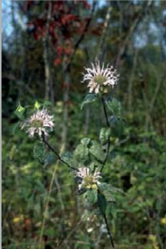
Photo courtesy of: ©Jim Stasz. This copyrighted image may be freely used for any non-commercial purpose. For commercial use please contact Jim Stasz . Please credit the artist, original publication if applicable, and the USDA-NRCS PLANTS Database. The following format is suggested and will be appreciated: Jim Stasz @ USDA-NRCS PLANTS Database.

Other common names; bee-balm, horse mint, mintleaf beebalm, bergamot, Oswego-tea.