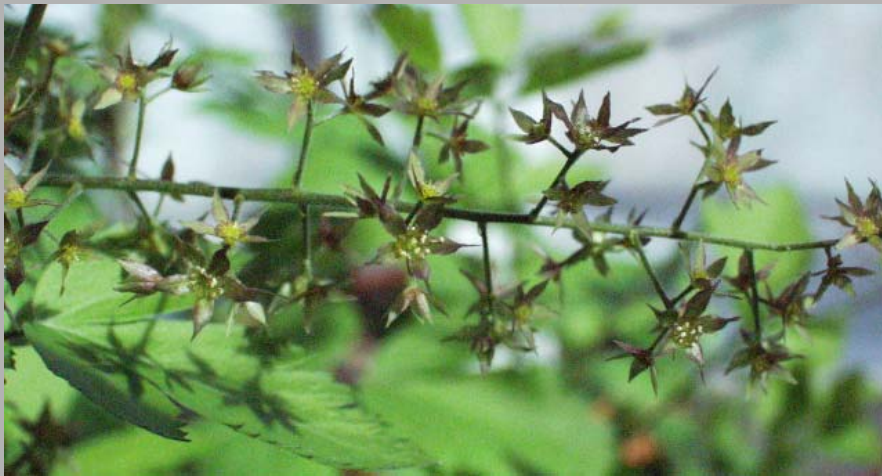
Ecology and Evolutionary Biology Conservatory. University of Connecticut.