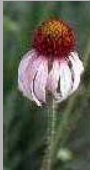
Photo courtesy of: Clarence A. Rechenstain. Courtesy of USDA NRCS Texas State Office . This image is not copyrighted and may be freely used for any purpose. Please credit the artist, original publication if applicable, and the USDA-NRCS PLANTS Database.

Other common names; purple coneflower, echinacea, Blacksamson, narrow-leaved purple coneflower, red sunflower, snakeroot, Kansas snakeroot, scurvy root, comb flower, hedge hog.