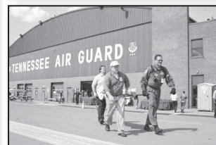
VHA's Comprehensive Emergency Management Program in Action: We Are Ready! Description of photos and (photographer), clockwise from top center: Federal Medical Station (FMS) operations, Ruston, LA. Patient reception activities, Lexington, KY., Hurricane Rita : FMS operations, San Antonio, TX with Governor Rick Perry (center) : Airport reception exercise, Nashville, TN. Decontamination exercise, Indianapolis, IN. airport patient reception during Hurricane Rita, Little Rock, AR. Hurricane Katrina prior to landfall ; and, VAMC incident management tabletop, Tomah, WI.