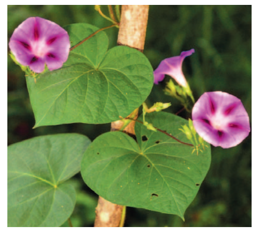
Photo credits: (above) Ted Bodner, Morning Glory; (lower left) Dave Powell USDA Forest Service, Cone Collecting www.forestryimages.org.

In conclusion, in the pursuit of locally adapted plant material for planting projects, there are countervailing risks of incurring inbreeding versus outbreeding depression. However, much can be inferred about the relative risks of each from plant characteristics. For example, the morning glory (Ipomoea purpurea) is self-compatible. In populations of this species in the southeastern U.S., bumble bees account for most of the pollination between plants and keep the pollen fairly local. That is, plants that are closer together are much more likely to be related than those further apart. Under these conditions, we would expect considerable inbreeding naturally in morning glory and that it is