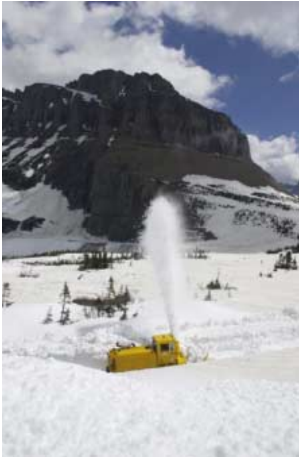
Clearing the Road Hungry Horse News Online, June 27, 2002

significance of the Road is exemplified by the National Historic Landmark designation, for which only two roads in the United States have been so designated. National Historic Landmarks are designated by the Secretary of the Interior because they possess exceptional value or quality in illustrating or interpreting the heritage of the United States.