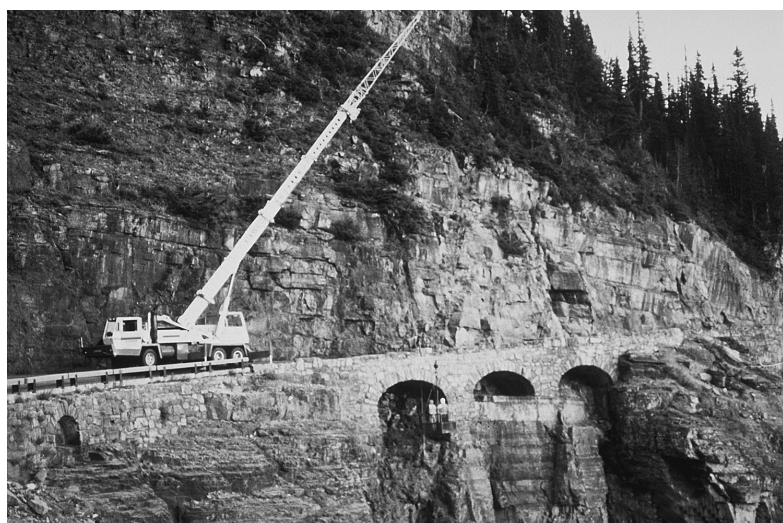
Repair work on Triple Arches

Serious safety concerns have surfaced due to the condition of the Road. Deterioration has resulted in drainage problems, cracked and uneven road surfaces, missing or low guardwalls, and damaged retaining walls.