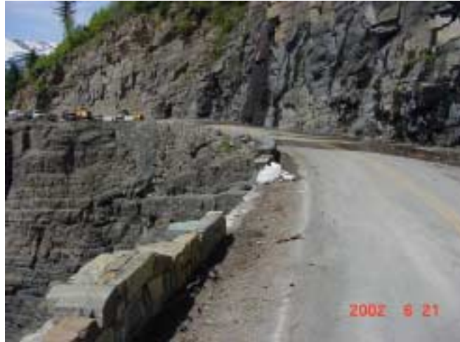
Guardrail damage, June 2002

to range from $140 million to $170 million. This alternative seeks to implement road repairs while maintaining visitor use and access to the Going-to-the-Sun Road similar to current conditions. The National Park Service concluded that the Shared Use Alternative meets the project objectives and provides the best overall balance in addressing needed Road rehabilitation, protecting and preserving historic, scenic, and natural resources, while allowing continued visitor access and minimizing impacts to local businesses.