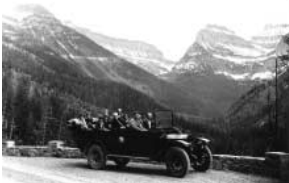
Scenic pullout west of Logan Pass

night work would affect the night sky and possibly wildlife and visitor enjoyment near these work zones; however, night work would be limited primarily to low elevation sites and would be used selectively for specific rehabilitation tasks.