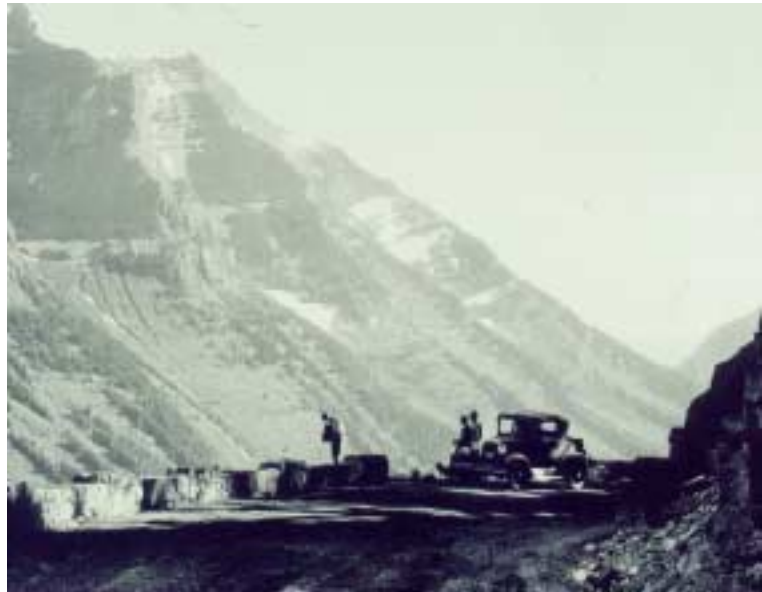
Capturing a scenic view in the 1930s

In 1999, the National Park Service concluded that the Going-to-the-Sun Road would be rehabilitated to preserve a National Historic Landmark and premier visitor experience in Glacier National Park. The focus of this Rehabilitation Plan/Environmental Impact Statement is how best to conduct the Road rehabilitation while minimizing impacts on the cultural, natural, and socio-economic resources. Studies and investigations have been conducted over the past 18 years on the condition of the Road. Engineering, socio-economic, visitor use, cultural resource, and other studies completed in 2001 and 2002 have further established the need to