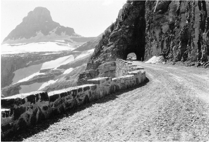
West tunnel in the 1930s

on visitor expenditures, party size, and residency. This information was used to update the estimated economic impacts to the local and regional economy for each of the alternatives. Construction costs and economic impacts were updated to 2002 dollars.