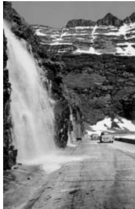
Weeping wall in the 1950s

The Going-to-the-Sun Road parallels several important water resources including Lake McDonald, St. Mary Lake, McDonald Creek and other streams that support fish and aquatic life. Ground-disturbing activities also have the potential to impact water and aquatic resources from erosion and sediment transport. Direct disturbances to water features are expected to be limited to bridge, culvert, and drainage repairs. While these activities may result in short-term disturbances to water resources, proposed drainage improvements are expected to result in a long-term beneficial effect to water and