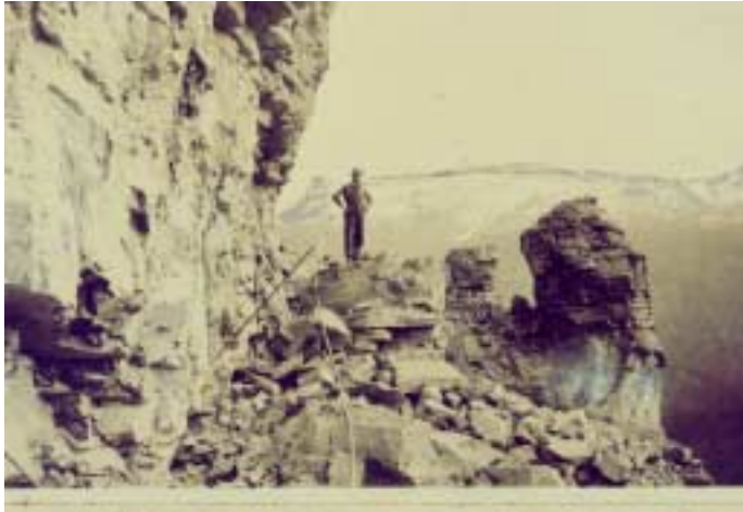
Original construction of the Going-to-the-Sun Road

integral component of the regional economy. Numerous tourist-related businesses are supported by visitors drawn from throughout the United States, Canada, and the world to visit Waterton-Glacier International Peace Park and enjoy the natural, cultural and scenic resources present along the Road.