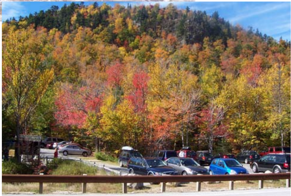
Cars fill the parking lot at Glen Ellis Falls on the Androscoggin Ranger District.