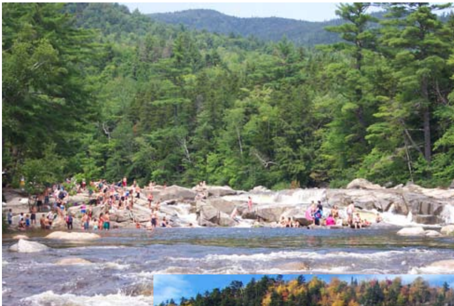
Lower Falls, a popular swimming and picnicking area on the Kancamagus Scenic Byway.

Recreation on the White Mountain National Forest means something different to each of us. Providing a variety of experience opportunities is one of the reasons the National Forest exists. No matter your choice of activity—a walk along a gentle forest path, a lengthy backcountry hike, or picnicking in a pavilion built by the Civilian Conservation Corps — you'll find your recreation fee dollars at work.