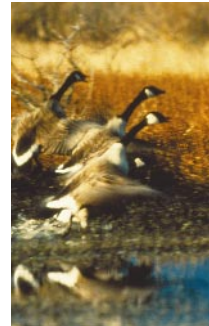
Canada geese. Blackwater National Wildlife Refuge, Maryland.