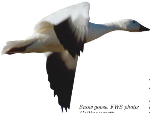
Snow goose.