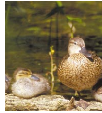
Blue-winged teal brood. J. Clark Salyer NWR, North Dakota.