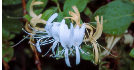
Japanese honeysuckle (Lonicera japonica) was brought to the United States from Asia as ground cover to prevent erosion. As an invasive species, it can topple small trees and shrubs by its weight. The resulting change in forest structure may negatively affect songbird populations.

The NBII Invasive Species Information Node creates a central repository for information pertaining to the identification, description, management, and control of invasive species.