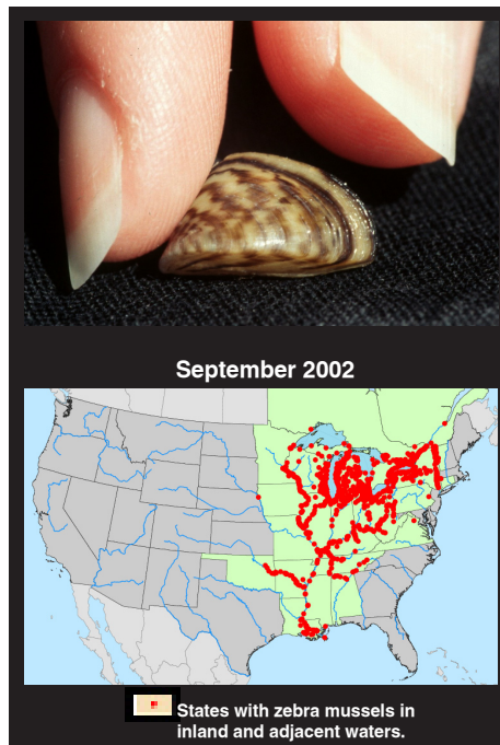
Zebra mussels (Dreissena polymorpha) clog pipes and concentrate contaminants in lakes, rivers, and streams.

Predictive spatial models—such as this map that forecasts invasive species richness after the recent wildfire near Los Alamos, NM—are the type of tools that must be produced in even higher resolution to help ensure our native species are protected in the decades ahead.