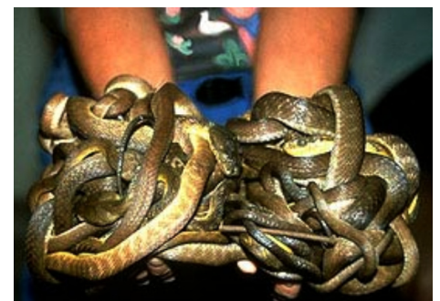
Brown tree snakes (Boiga irregularis) in Guam have caused the extinction of several native bird species.

Find us on the Web at: < http://invasivespecies.nbii.gov >.