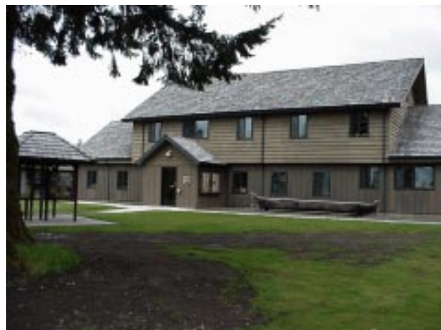
Pacific Ranger District's Forks Office.

The ONF/ONP Recreation Information Office is located on Highway 101 in the middle of Forks on the east side of the highway.