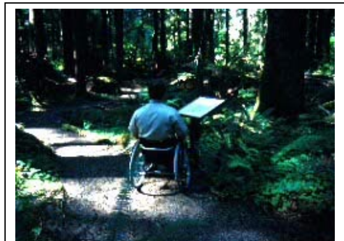
The Pioneer's Path Nature Trail #884 provides easy barrier-free access to a beautiful stand of conifers, lush rain forest vegetation, and the Sol Duc River. Colorful signs interpret the history of the Sol Duc Valley.

TRAIL INFORMATION: This short 0.3 mile loop trail provides barrier-free access and has colorful signs that interprets how the early pioneers work and lived off the land in this serene landscape along the Sol Duc River.