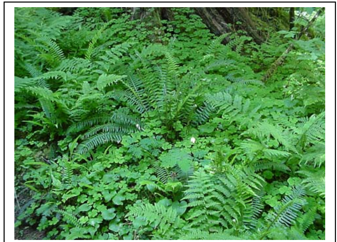
Lush plants carpet the forest floor.

The campground has a lush and diverse understory of wildflowers, ferns, mosses and shrubs. These lie underneath a canopy of legacy old-growth spruce, eight feet in diameter, among smaller 3 to 4’ diameter hemlock. 6/2005