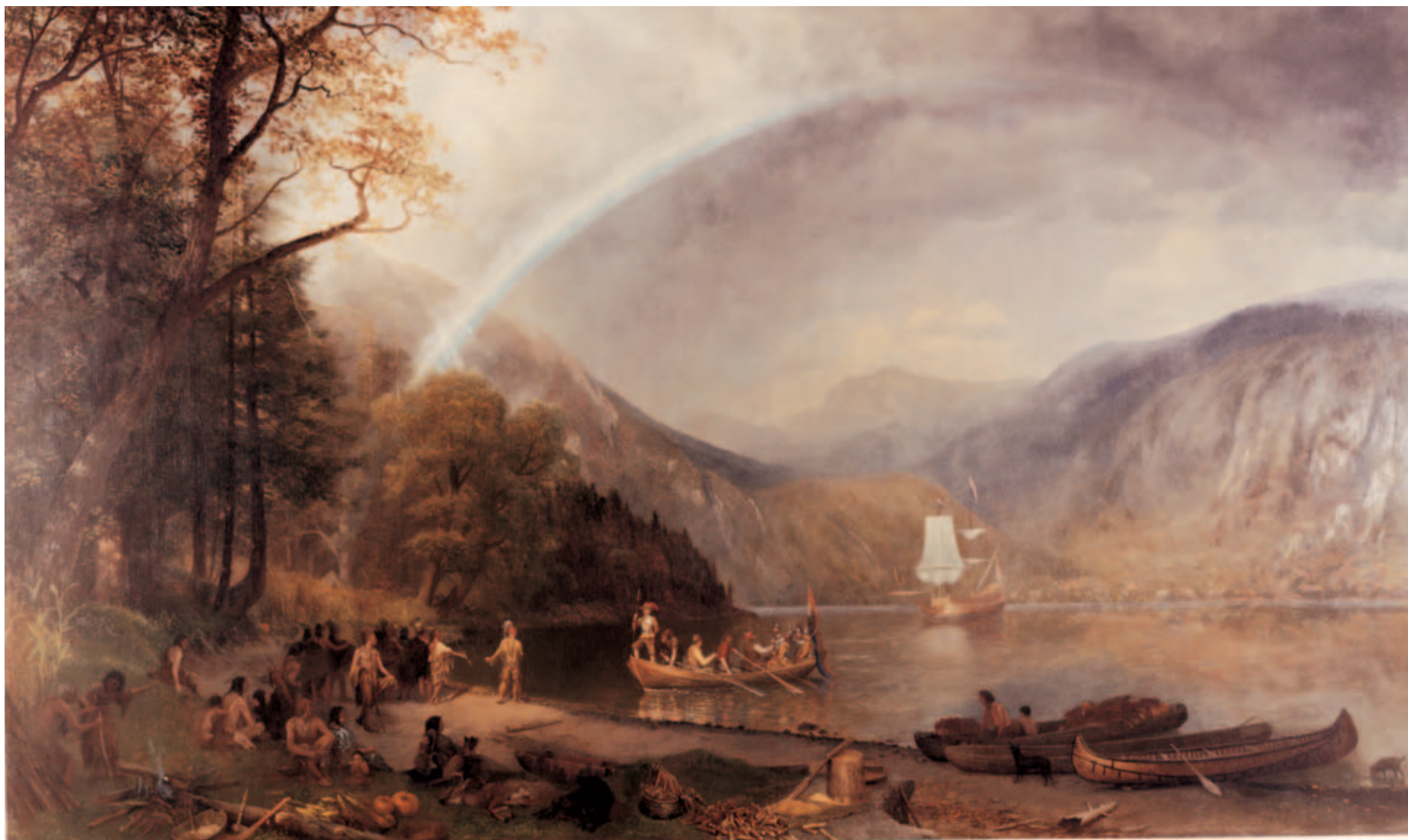
DISCOVERY OF THE HUDSON, ALBERT BIERSTADT, PAINTER.

Discovery of the Hudson River , oil on canvas, purchased in 1875, currently in storage.