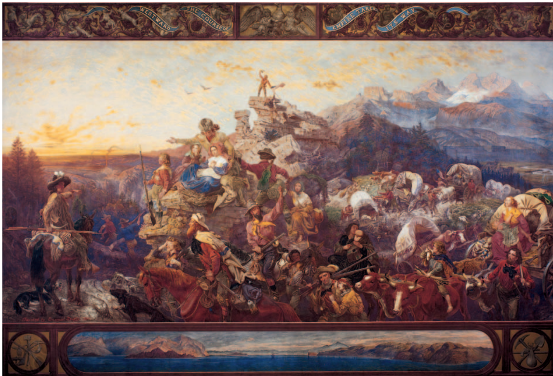
WESTWARD, THE COURSE OF EMPIRE TAKES ITS WAY, EMANUEL LEUTZE, PAINTER. Stereochromy, 1862, located in the House wing, west stairway.