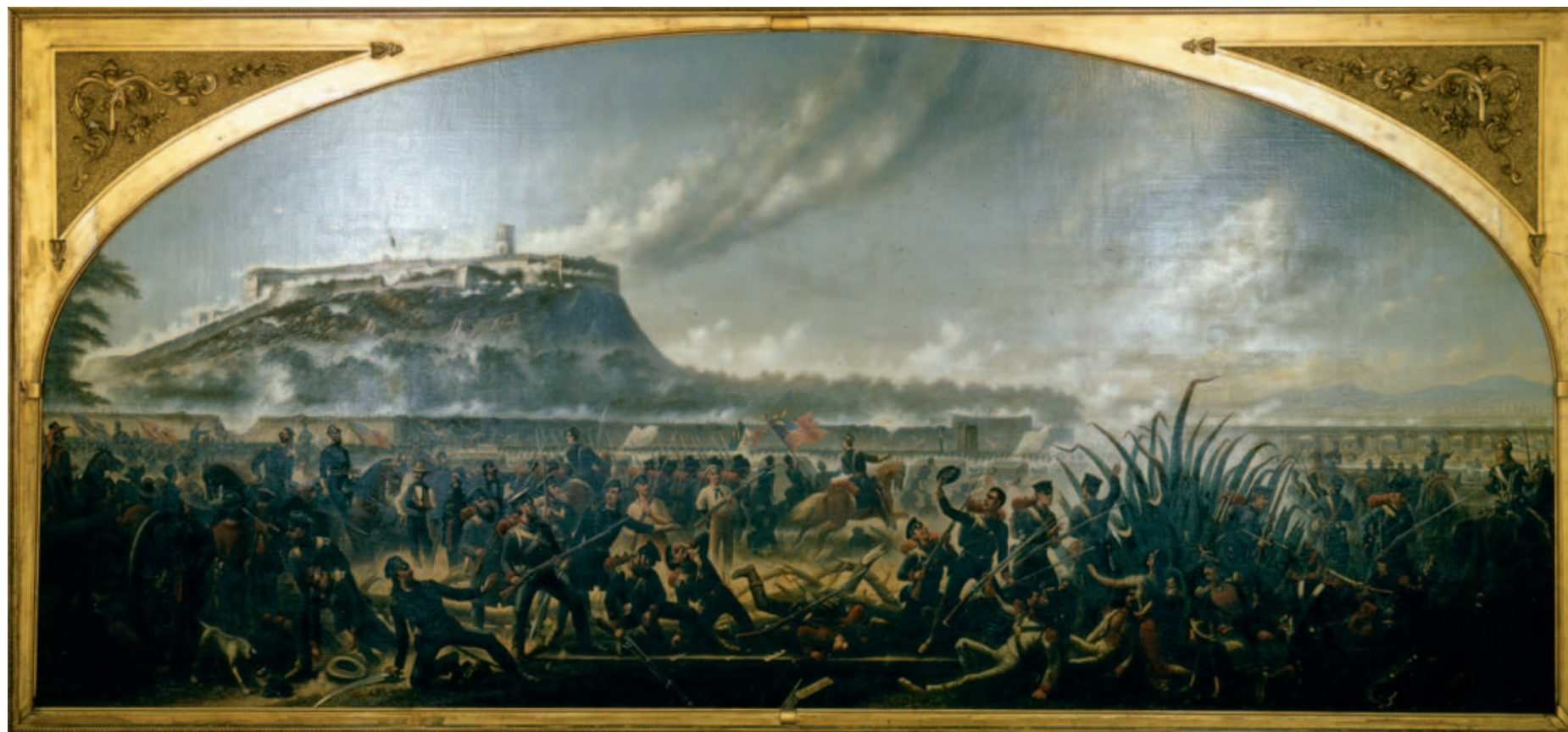
THE BATTLE OF CHAPULTEPEC,—BY JAMES WALKER. Oil on canvas, purchased in 1862; now on loan outside the Capitol.