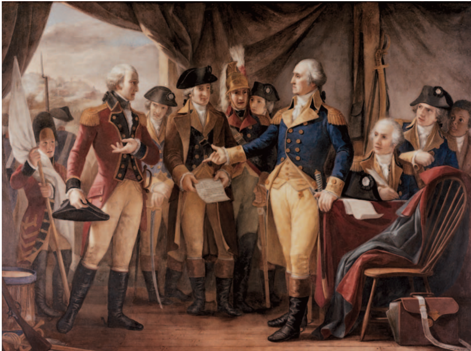
WASHINGTON'S HEADQUARTERS IN YORKTOWN,—FRESCO BY BRUMIDI.

Cornwallis Sues for Cessation of Hostilities Under the Flag of Truce, 1857.