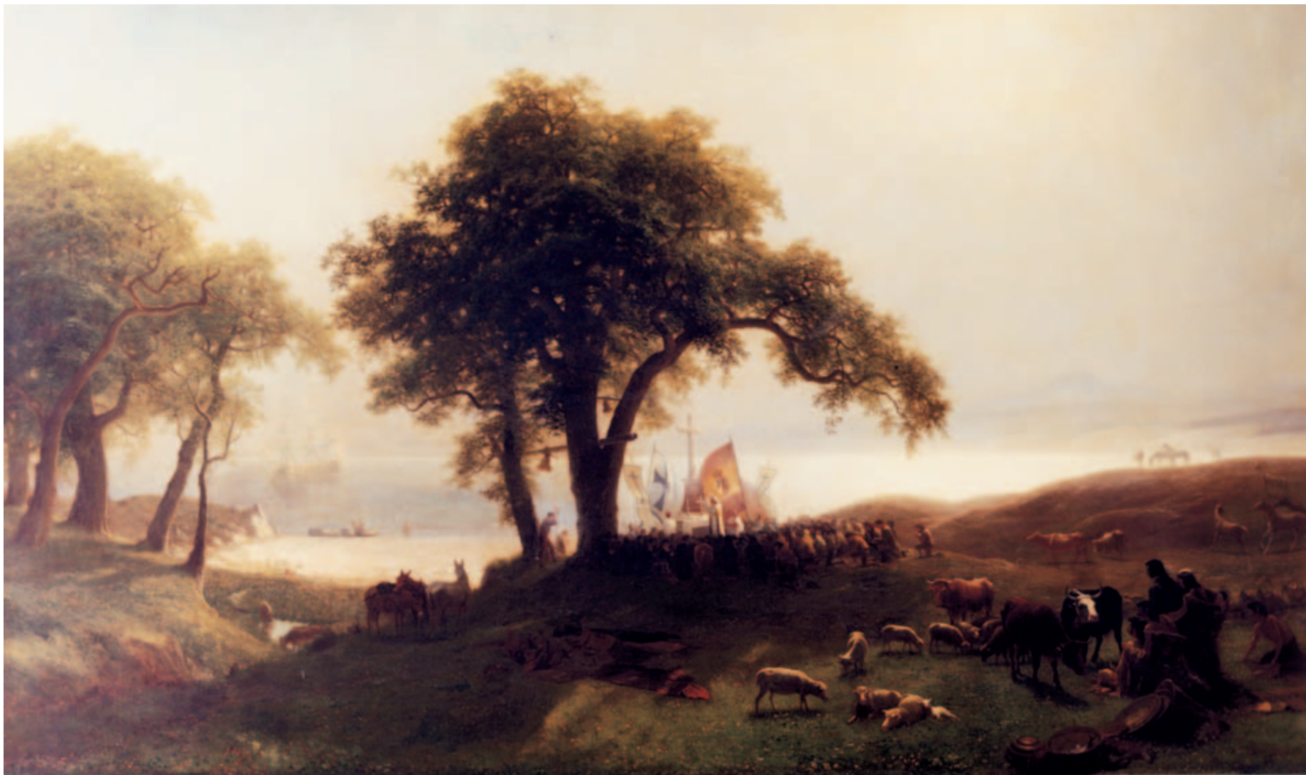
CALIFORNIA LANDSCAPE, ALBERT BIERSTADT, PAINTER.

Entrance Into Monterey , oil on canvas, purchased 1878, currently in storage.