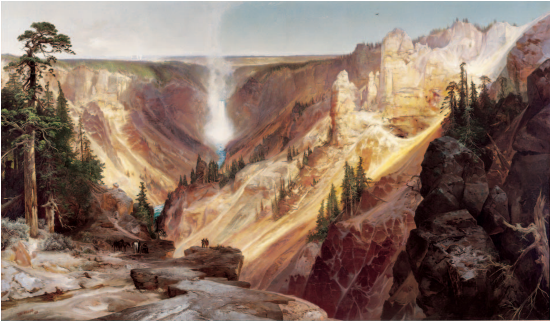
THE GRAND CANYON OF THE YELLOWSTONE, THOS. MORAN, PAINTER.

Oil on canvas, 1872, transferred to the Department of the Interior in 1950. On loan to the Smithsonian American Art Museum, Smithsonian Institution.