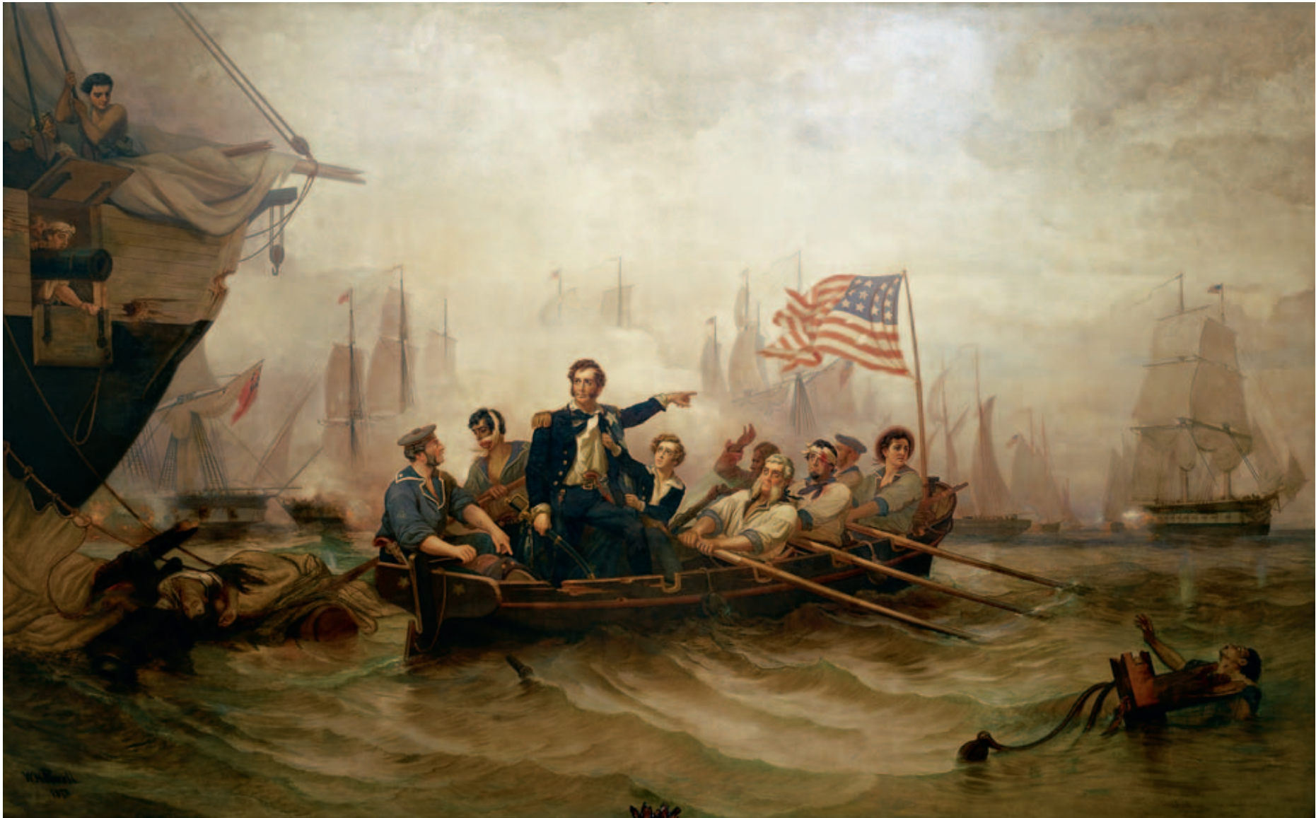
PERRY'S VICTORY ON LAKE ERIE, W. H. POWELL, PAINTER.

Battle of Lake Erie , oil on canvas, 1873, located in the Senate wing, east staircase.