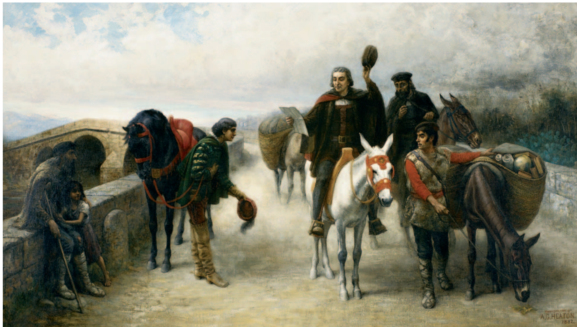
THE RECALL OF COLUMBUS, A. G. HEATON, PAINTER. Oil on canvas, 1882, located in Senate wing, third floor, east corridor.