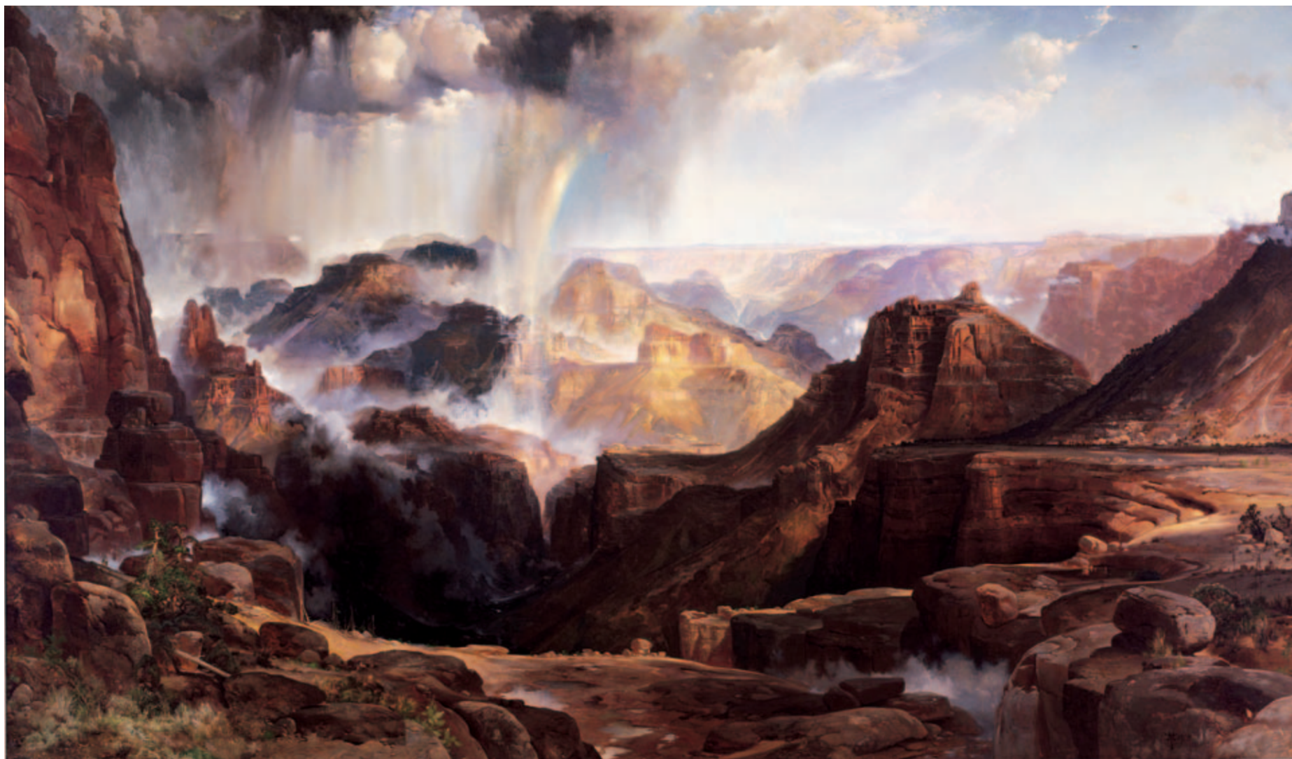
THE CHASM OF THE COLORADO BY THOMAS MORAN.

Oil on canvas, 1874, transferred to the Department of the Interior in 1950. On loan to the Smithsonian American Art Museum, Smithsonian Institution.