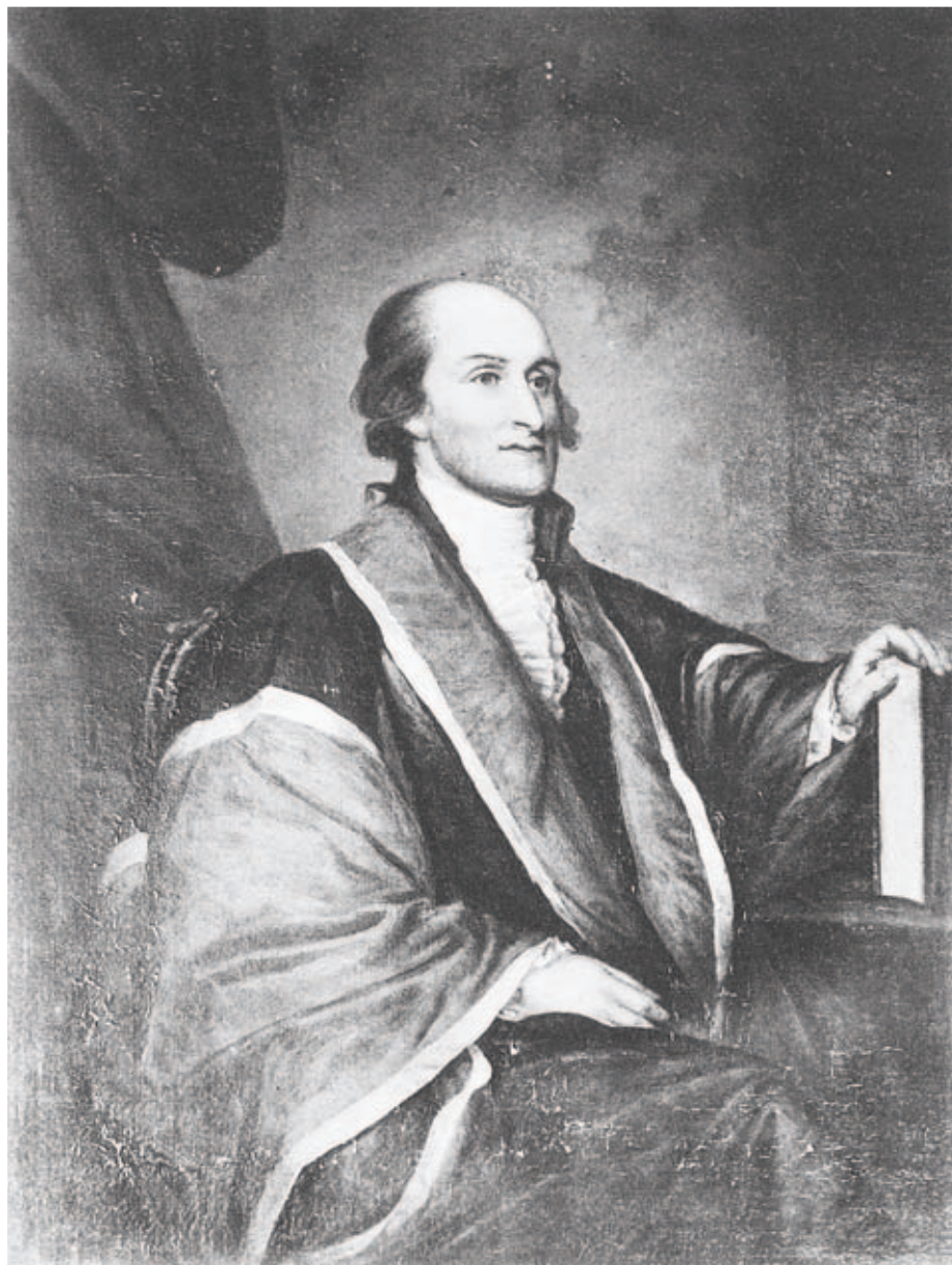
JOHN JAY, COPY BY GRAY AFTER GILBERT STUART.