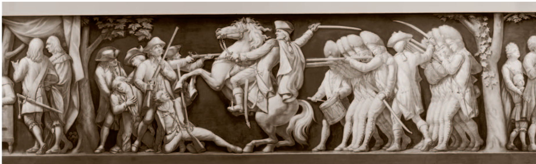
FRESCO ON FRIEZE OF ROTUNDA, THE BATTLE OF LEXINGTON, BRUMIDI & COSTAGGINI, PAINTERS.

Modern photograph showing the painting after restoration.