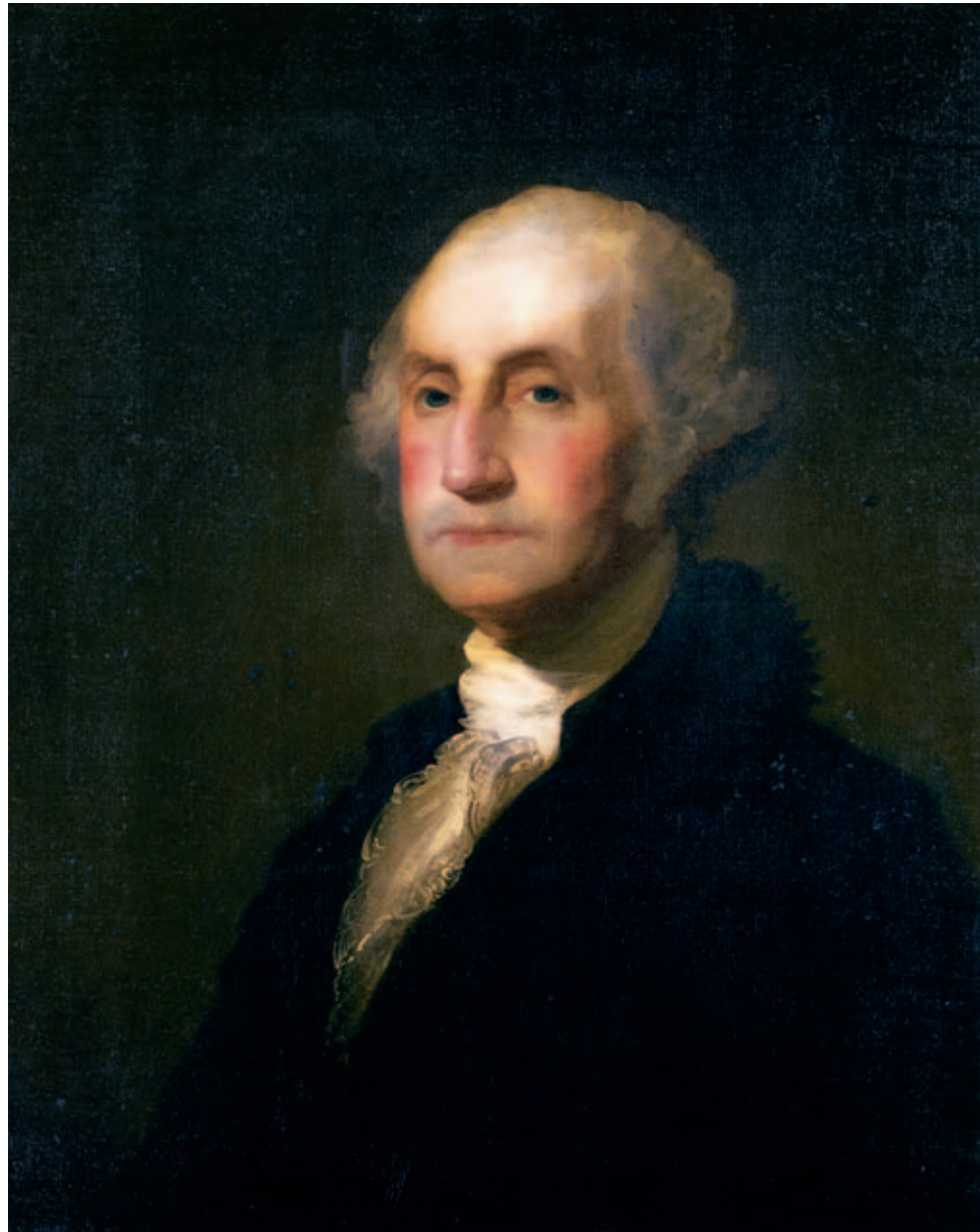
GEORGE WASHINGTON,—BY GILBERT STUART.

Oil on canvas, purchased 1876, located in S-207.