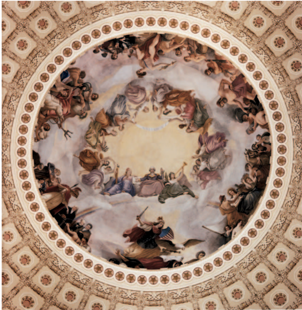
VIEW OF ROTUNDA FROM FLOOR, FRESCO BY BRUMIDI. Apotheosis of George Washington , fresco, 1865, canopy of the dome.