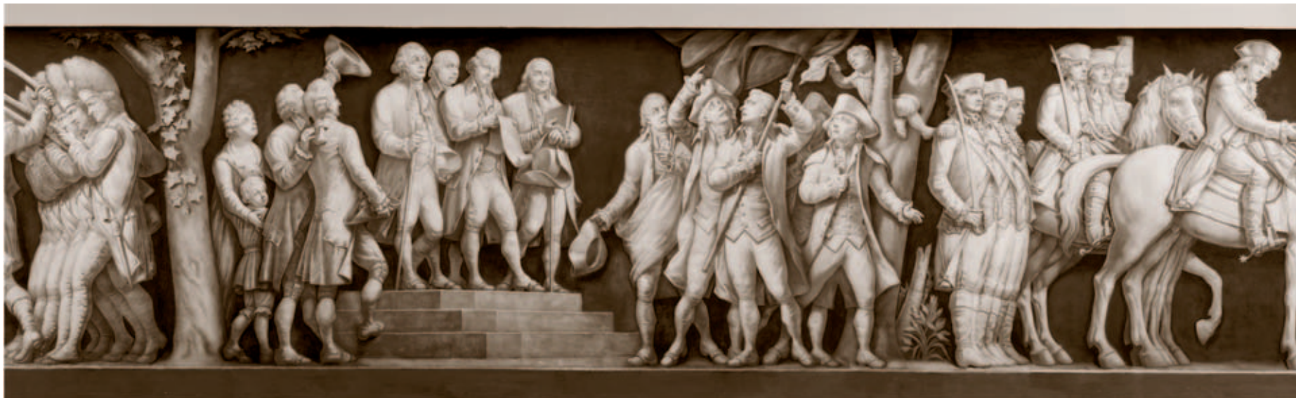
THE DECLARATION OF INDEPENDENCE, FRESCO ON FRIEZE OF ROTUNDA,—BRUMIDI & COSTAGGINI, PAINTERS.

Modern photograph showing the painting after restoration.