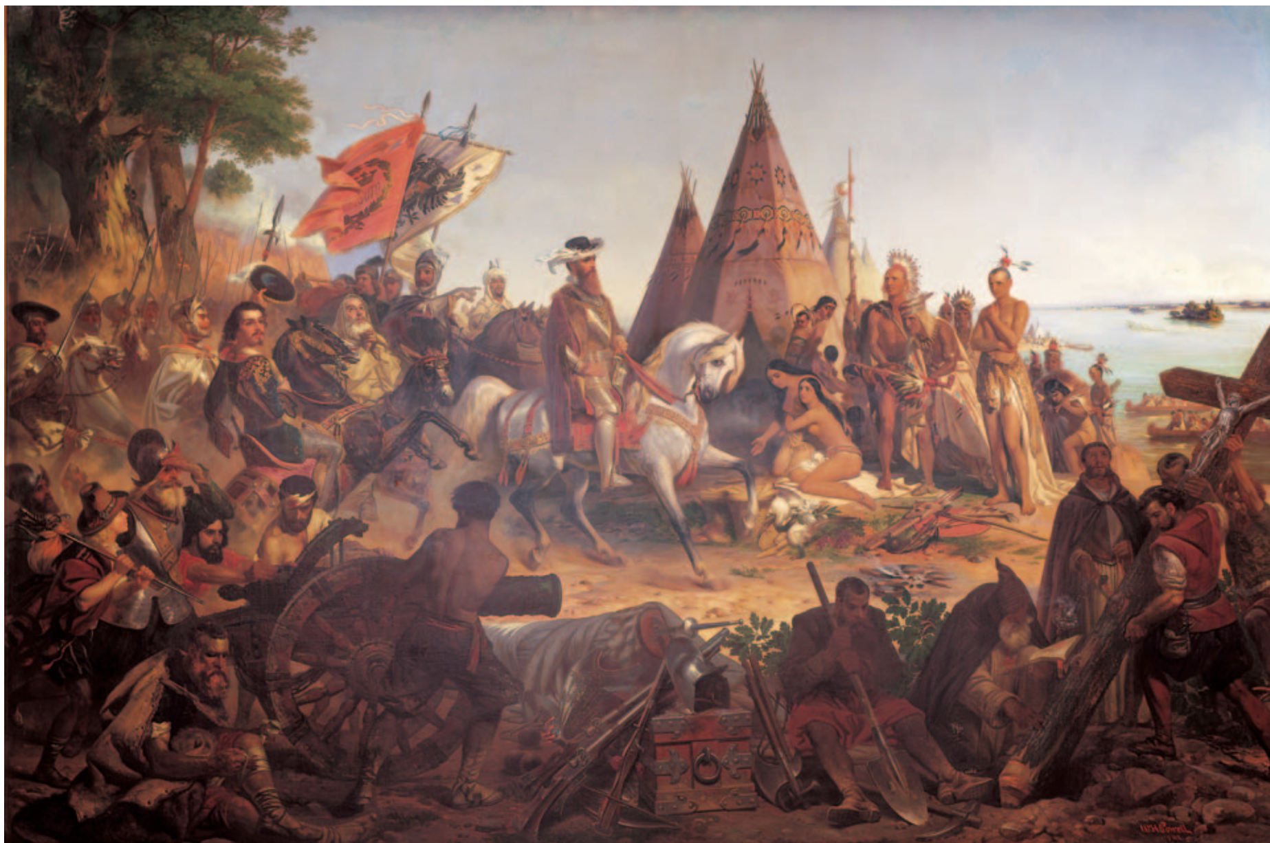
THE DISCOVERY OF THE MISSISSIPPI, WM. H. POWELL, PAINTER.

Oil on canvas, 1853, located in the Capitol Rotunda.