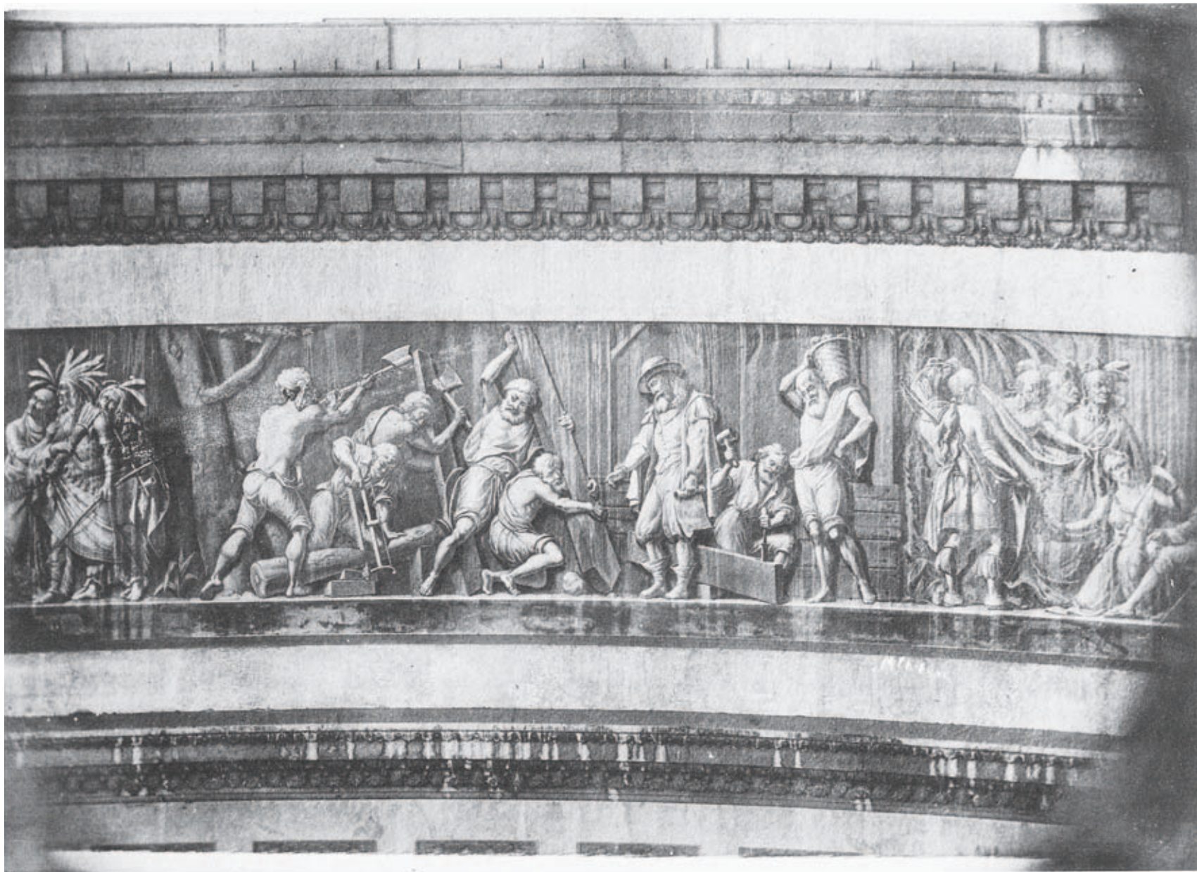
ERECTING THE FIRST HOUSE IN PLYMOUTH, FRESCO ON FRIEZE OF ROTUNDA,—BRUMIDI & COSTAGGINI, PAINTERS.

Photograph showing the extensive damage caused by leaks in the late nineteenth century.