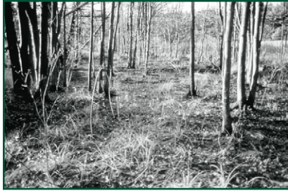
Forested swamps serve a critical role in the watershed by reducing the risk and severity of flooding to downstream areas.

Forested swamps are found in broad floodplains of the northeast, southeast, and south-central United States and receive floodwater from nearby rivers and streams. Common deciduous trees found in these areas include bald cypress, water tupelo, swamp white oak, and red maple.