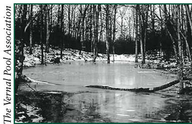
The Vernal Pool Association

Many vernal pools fill with water in fall or spring.