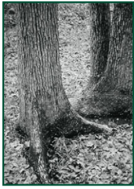
Trees found in swamps are sometimes buttressed at the base, which helps anchor them in the saturated soils.

SWAMPS are fed primarily by surface water inputs and are dominated by trees and shrubs. Swamps occur in either freshwater or saltwater floodplains. They are characterized by very wet soils during the growing season and standing water during certain times of the year. Well-known swamps include Georgia's Okefenokee Swamp and Virginia's Great Dismal Swamp. Swamps are classified as forested, shrub, or mangrove.