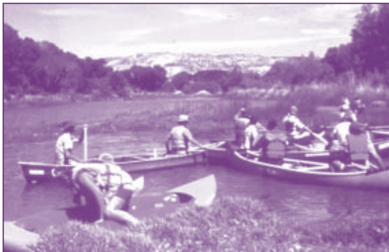
Canoeists at the District of Columbia's Camp Riverview explore the coastal wetlands located near their site.

Wetlands benefit our communities as well. They replenish and clean water supplies and reduce flood risks, provide recreational opportunities and aesthetic benefits. They serve as sites for scientific research and education, and benefit commercial fishing.