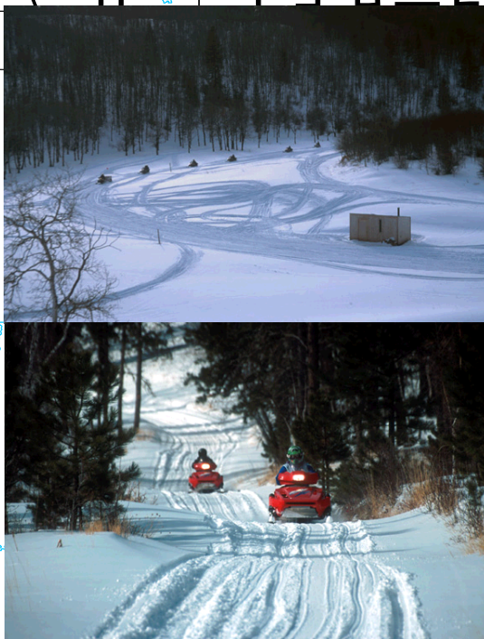
Think SNOW and enjoy your National Forest.