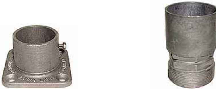
Figure 2. Examples of Frangible Couplings

b. Common applications of frangible couplings (Figure 2) are found in light posts, masts, and electrical metallic tubing (EMT) supports for runway and taxiway lights (See ACs 150/5345-44, 150/5345-46, and FAA Drawing C-6046 for frangibility requirements). It is important to recognize that many types of frangible couplings are available, and only those types approved for the purpose or application originally intended should be used.