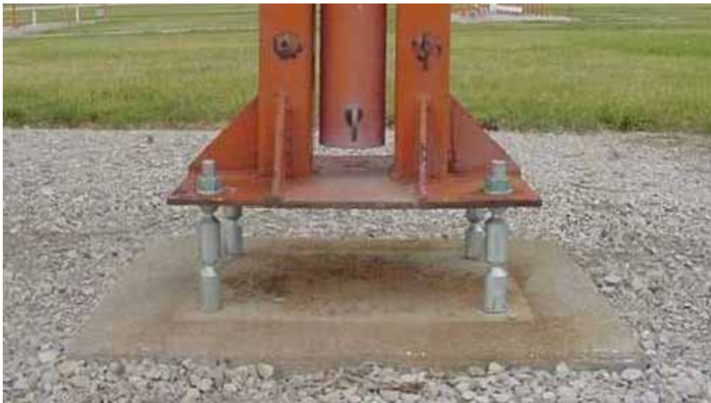
Figure 1. Application of Fuse Bolts

a. Failure of this type of connection is induced by providing a “stress raiser,” due to removal of material from the bolt shank. One method used to achieve this is to machine a groove to reduce the bolt diameter or to machine flats in the sides of the bolts, making it weaker in a specific direction. Shear strength is maintained and tensile strength is reduced by machining a hole through the bolt diameter and locating it out of the shear plane. Fuse bolts must be carefully installed to ensure they are not damaged or overstressed when tightened. One disadvantage of fuse bolts is that the stress raiser may shorten the fatigue life of the bolt or may propagate under service loads and fail prematurely. Fuse bolts with machine grooves are commercially available. See Figure 1 as an example of the application of such fuse bolts. (Reference ICAO Aerodrome Design Manual , Part 6, Section 4.5.2.a)