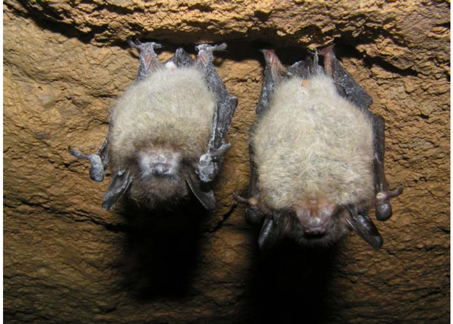
Photo of bats infected with white nose syndrome in a cave on the Monongahela NF

Bats affected with WNS do not always have the fungus, but may display abnormal behaviors such as flying outside in the winter or clustering near the entrance of caves or mines. Dead or dying bats may be found in caves or mines, or on the ground, on buildings, or on other surfaces.