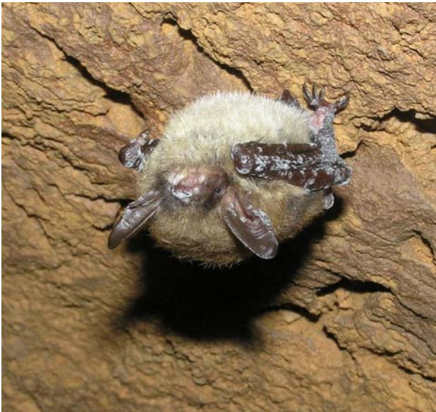
Photo of bat infected with white nose syndrome

The term White-nose Syndrome was coined by biologists who observed a white fungus on the noses of affected bats. The fungus is new to science and may possibly be an invasive species. The best available science shows that this fungus thrives in the cold and wet conditions common to subterranean caves and abandoned mines.