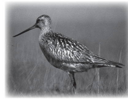
Birders from all over the world visit Homer for the Shorebird Festival.

Email info@IslandsAndOcean.org or Visit our website at www.IslandsAndOcean.org