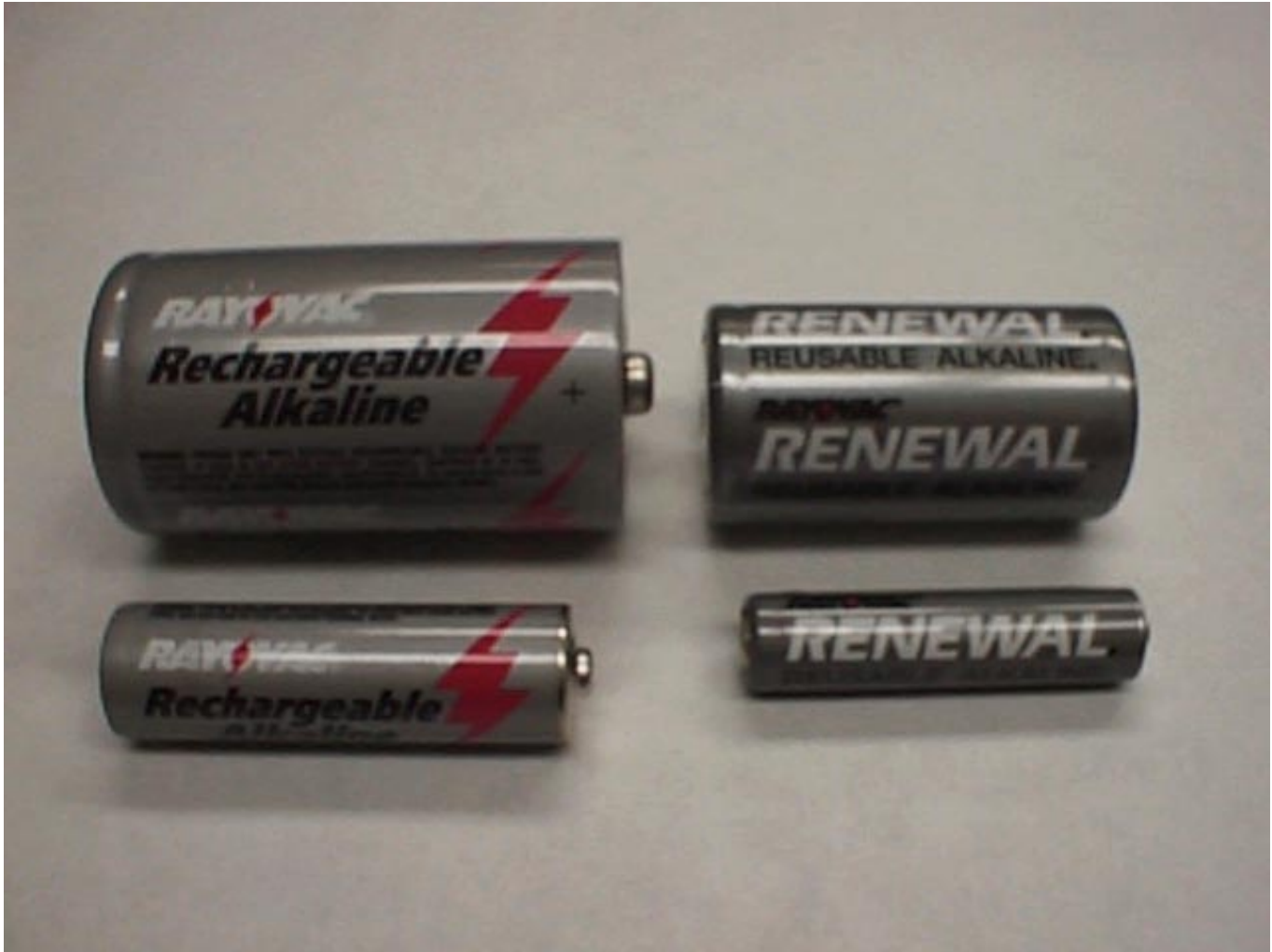
FIGURE 2-1. Rayovac Renewal® Batteries