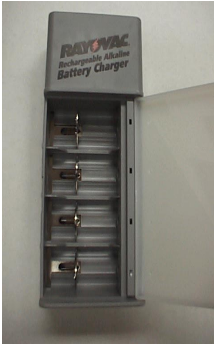
FIGURE 2-2. Rayovac Charging Unit (PS3)