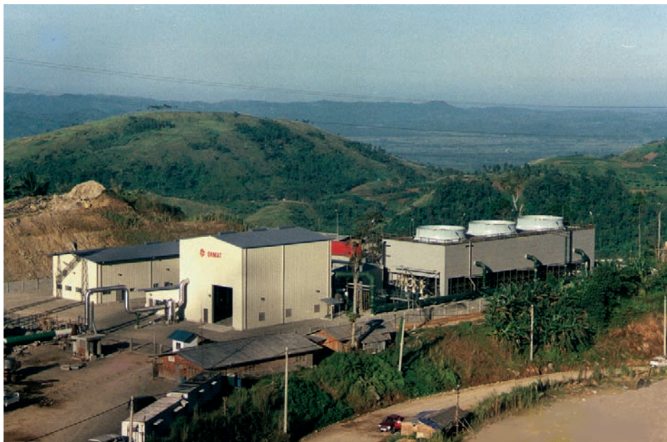
ORMAT LEYTE GEOTHERMAL PLANT, LEYTE, PHILIPPINES - ORMAT TECHNOLOGIES INC.

Ex-Im Bank's staff officers will work diligently to find the right solution for each transaction.