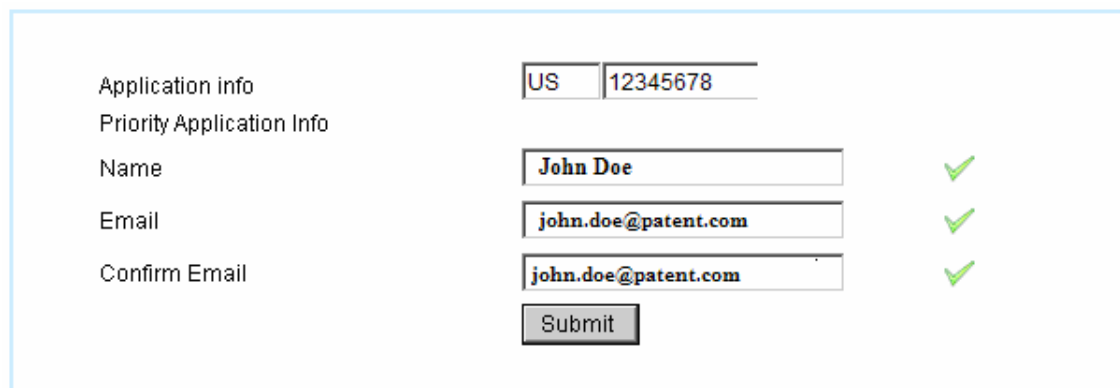
Figure 2: Applicant's email information for confirmation status notification