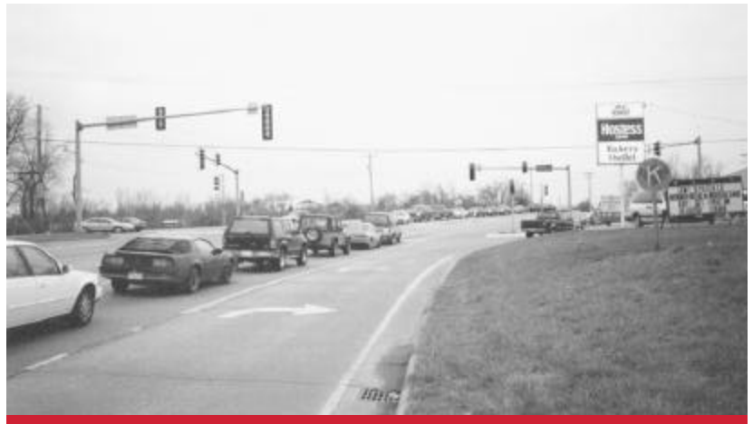
Right-turn lane was installed at this signalized intersection located at SR 159 and Center Grove Rd/Goshen Rd in Edwardsville, Illinois

For 260 of the 280 improved intersections (93 percent), re-