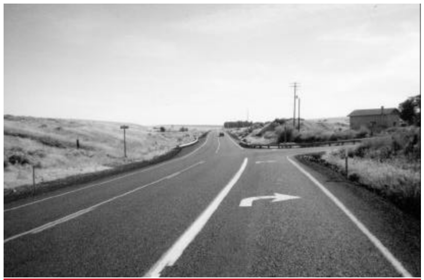
Right-turn lane was installed at this unsignalized intersection located at US 97 and Moore Lane in Sherman County, Oregon