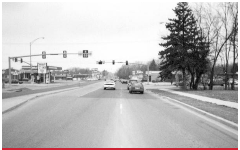
Left-turn lane was installed at this signalized intersection located at US 18 and Pierce Avenue in Mason City, Iowa