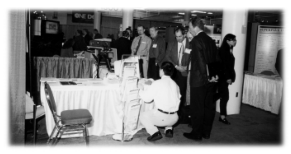
FHWA was the ONE-DOT coordinator for this major event, advising and helping other modal exhibitors to reflect the DOT theme for TRB, "Innovations for Transportation Excellence in the 21st Century."

FHWA had 71 booth displays at the exposition. The booths highlighted activities and projects within the agency's Core Business Units and Service Business Units. A display featuring services of the new FHWA Resource Centers was also showcased. Products from poolfunded FHWA/industry research partnerships with Humbolt