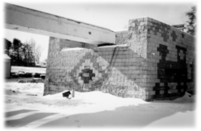
This recently completed full-scale GRS embankment/abutment project, located at TFHRC, was completed in April 1999.