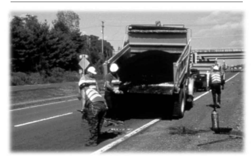
National Work-Zone Safety Awareness Week (April 3–7) will remind the public to take greater care while driving through work zones.

HWA, the American Traffic Safety Service Association (ATSSA), and the American Association of State Highway and Transportation Officials (AASHTO) signed a memorandum of understanding on December 15, 1999, to designate April 3–7 as National Work-Zone Safety Awareness Week.