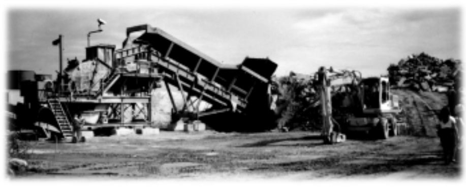
Pictured here is a concrete crusher at the Jean Lefebvre Inc. reclaiming facility in Pontiblon, France. Concrete from pavement and building slabs and construction and demolition wastes are processed and sorted into many aggregate gradations. The final product is widely used in road construction in France.

In all of the countries, C&D aggregates are high quality and are widely used in road construction. Processing facilities can produce wide ranges of aggregate sizes for blending with natural materials. In many of the countries, foamed bitumen is