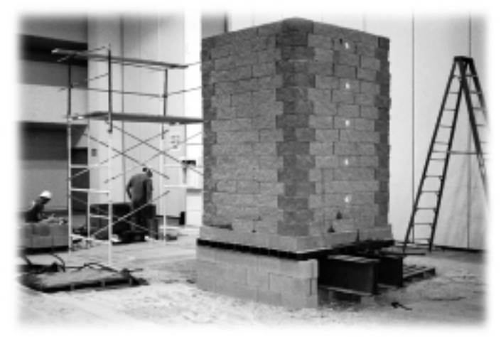
This GRS mass was constructed and load tested at the Masonry EXPO 2000 in Las Vegas, NV.

The GRS mass was loaded with an equivalent stress of 1000 kPa (10.5 tsf); this is presumed to be a world record. The GRS system deformed as expected. The maximum lateral strain was 2 percent. As outlined in the current specifications, the allowable vertical stress for such structures is 200 kPa (2.1 tsf). At 200 kPa, strain was 0.4 percent; vertical settlement and lateral deformation was 10 mm (0.4 in), and 2.5 mm (0.1 in), respectively. Mike Adams (202) 493-3025 mike.adams@fhwa.dot.gov