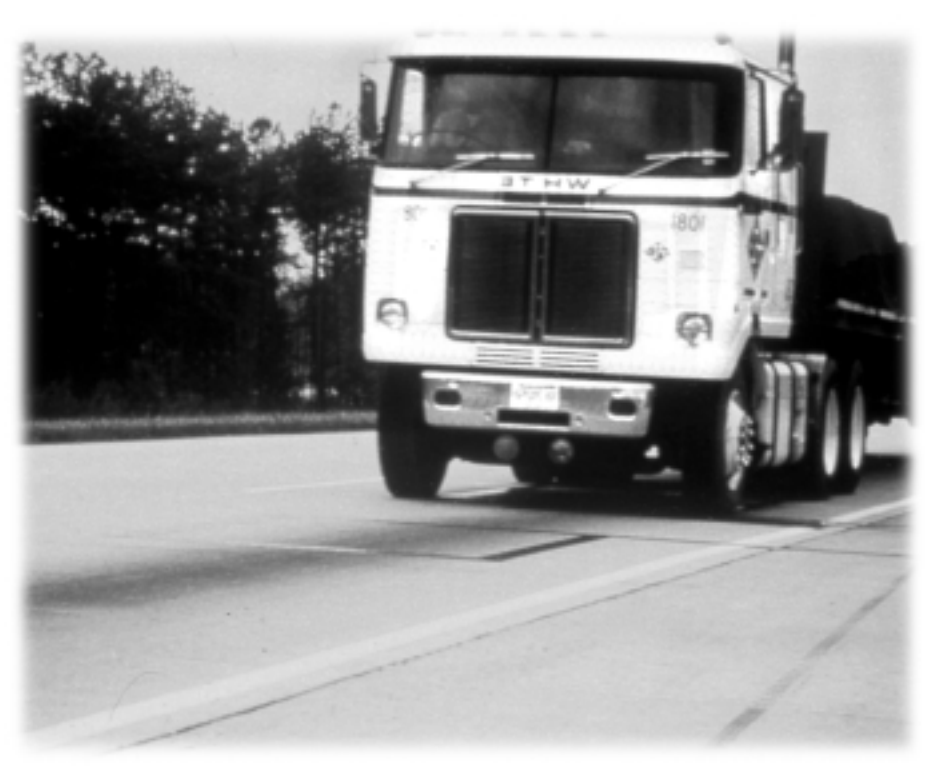
FMCSA's researchers compare training effectiveness for entry-level drivers who have been trained in a simulator to those drivers trained in an actual tractor-trailer.

One part of the research will compare training effectiveness for entry-level drivers who have been trained in a simulator versus those trained in an actual tractor-trailer. The commercial driver's license (CDL) examination will be the ultimate criterion task for providing evidence that simulation-based