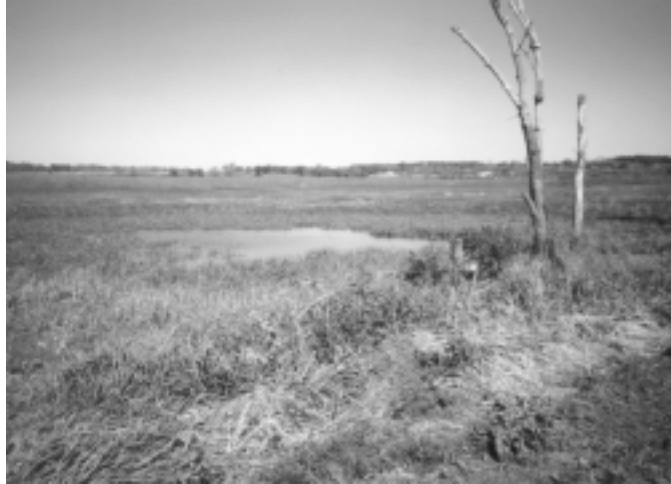
Mark Twain NWR Complex