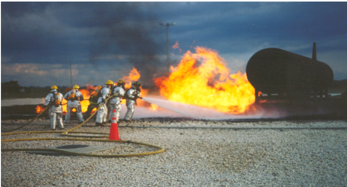
FIGURE 4. FIREFIGHTERS TRAINING AT A PROPANE FACILITY

Figure 4 shows firefighters training at a propane facility using hand lines.