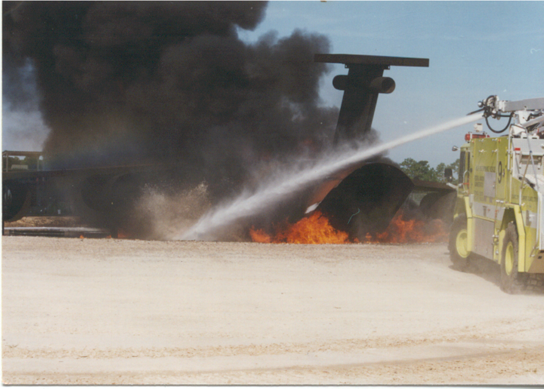
FIGURE 6. AIRCRAFT RESCUE AND FIREFIGHTING VEHICLE FIGHTING A REAL FUEL FIRE

INTERFACES. The FAA William J. Hughes Technical Center’s airport rescue and firefighting personnel closely coordinate its research and development efforts with those of other Government agencies, such as the United States Navy (NAVSEA) and the USAF (Tyndall Air Force Base). A good working relationship has been established over the years with groups in the private sector, such as 3M, Angus Fire Armour Corporation, Chubb National Foam, Inc., Ansul Fire Protection, Emergency One, Oshkosh Truck Company, and Crash Rescue Equipment Services.