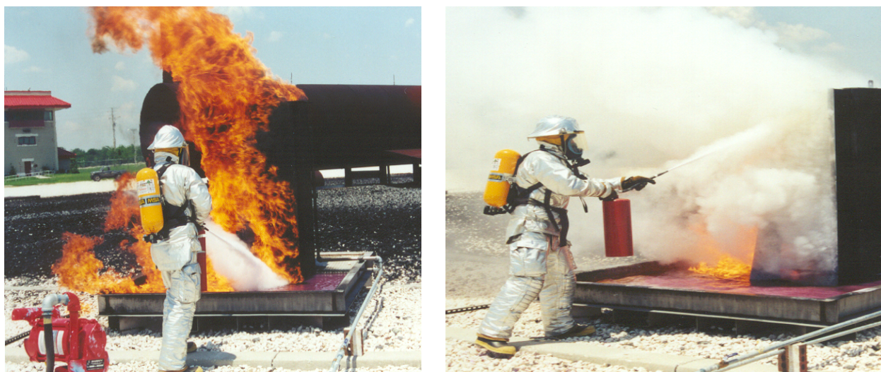
FIGURE 3. NEW COMPLEMENTARY AGENT TEST PROCEDURES

Figure 3 shows dry chemical agents undergoing tests using the FAA’s new complementary agent test procedures.