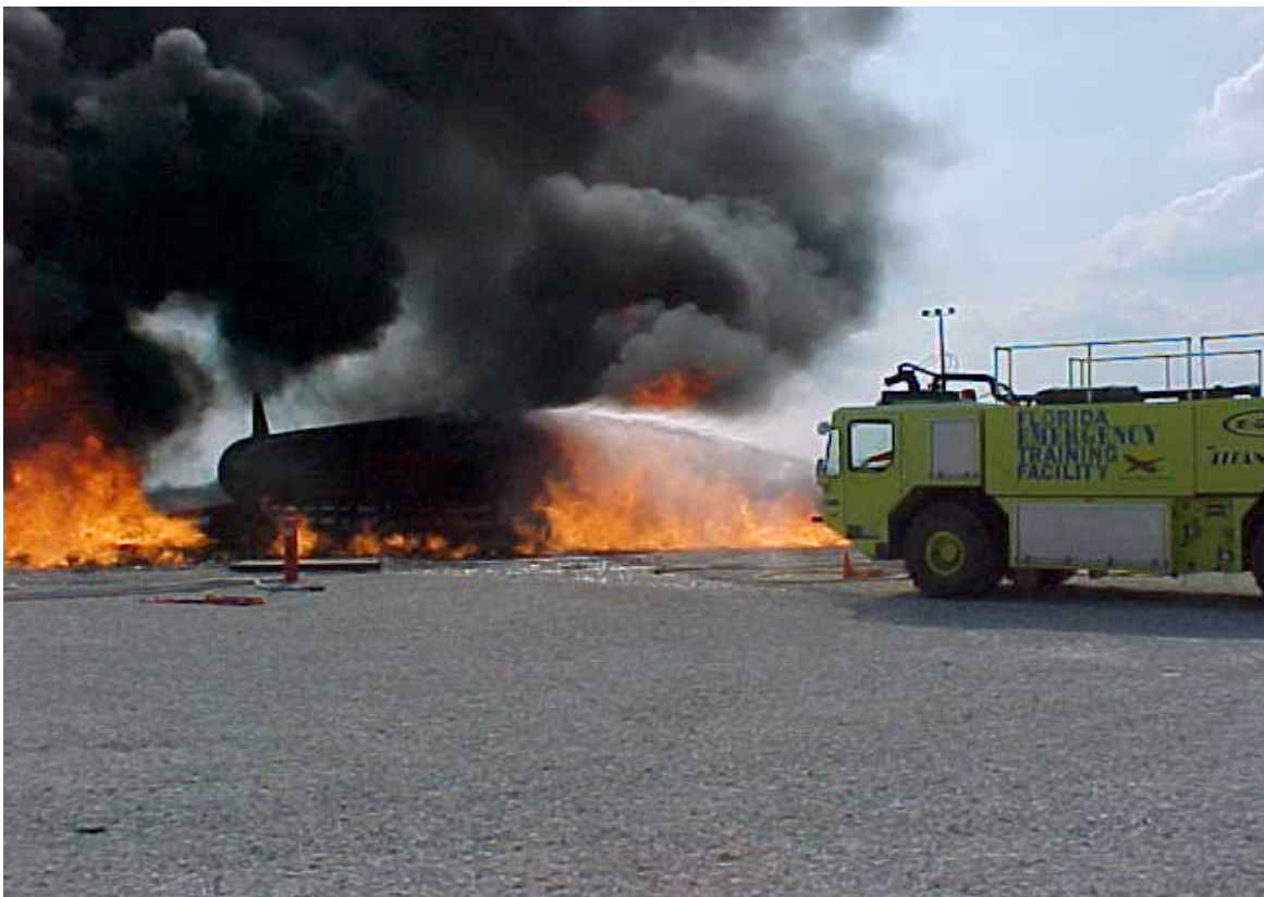
FIGURE 5. AIRCRAFT RESCUE AND FIREFIGHTING VEHICLE FIGHTING A PROPANE-SIMULATED FIRE

Figures 5 and 6 show ARFF vehicles fighting a computer-controlled propane fire and a real aviation fuel fire.