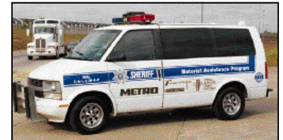
HOUSTON METRO SAFETY SERVICE PATROL VAN