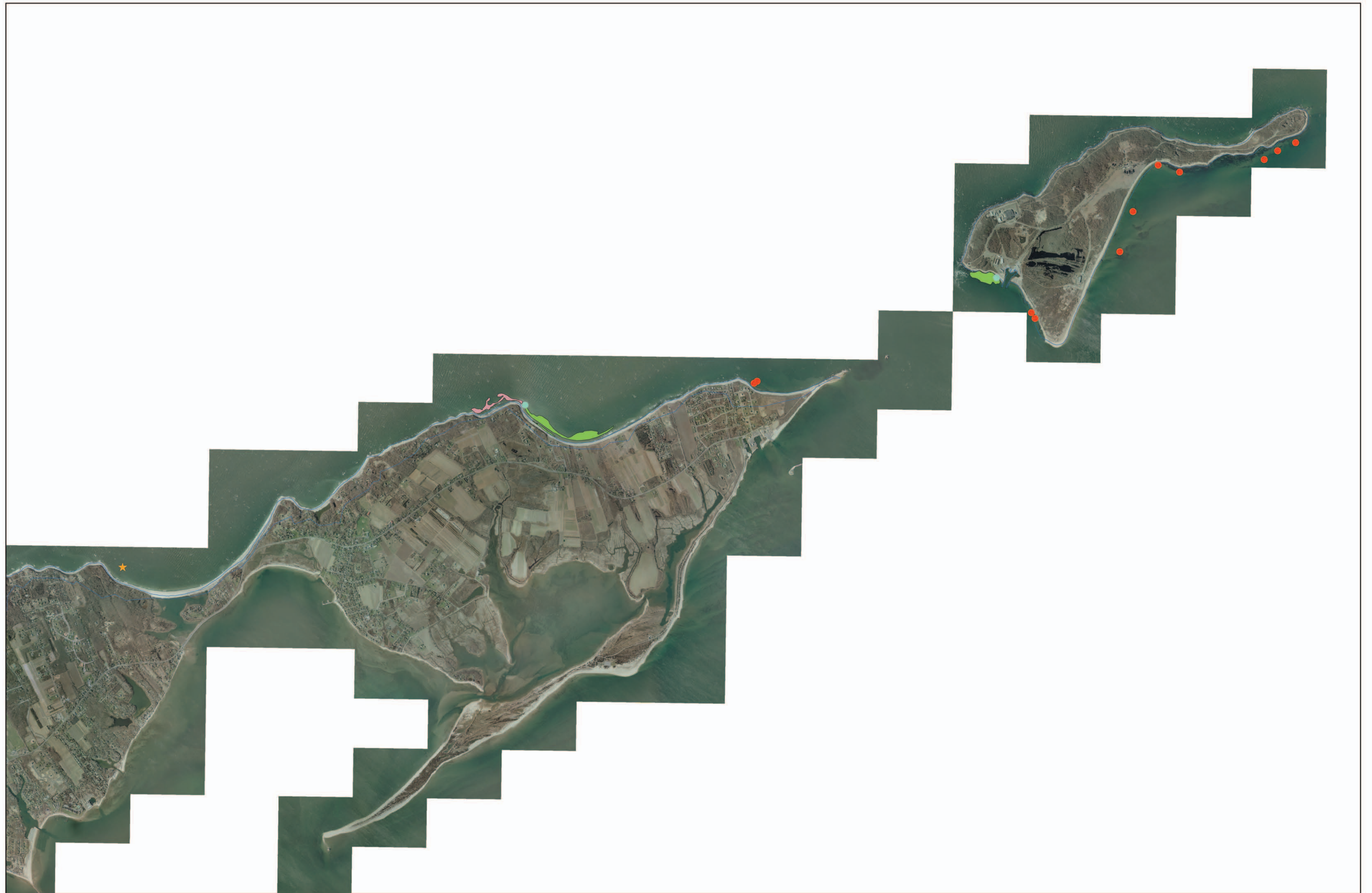
Study Area Locus Map

Long Island North Shore/Plum Island, New York