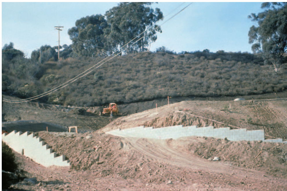
An incidental take permit allows for development and the incidental take of listed species that may result from the otherwise lawful activities. To offset any such take, the developer agrees to follow conservation measures set forth in a habitat conservation plan.

The activities authorized by permits differ depending on whether the species affected