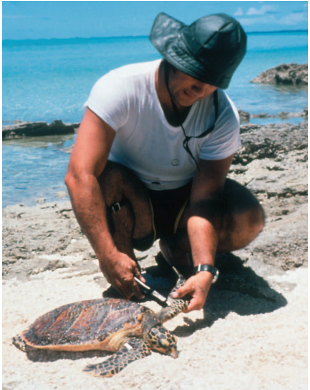
Conducting scientific research involving endangered or threatened species (such as monitoring sea turtle behavior through tagging, above) requires an endangered species or threatened species recovery permit.

Species held in captivity or in a controlled environment on (a) December 28, 1973, or (b) the date of publication in the Federal Register for final listing, whichever is later, are exempt from prohibitions of the Act, provided such holding or any subsequent holding or use of the specimen was not in the course of a commercial activity (any activity that is intended for profit or gain). An affidavit and supporting material documenting pre-Act status must accompany the shipment of listed species. A pre-Act exemption does not apply to wildlife, including parts and products, offered for sale. Any endangered or threatened specimens born in captivity from pre-Act parents are fully protected and are not considered pre-Act.